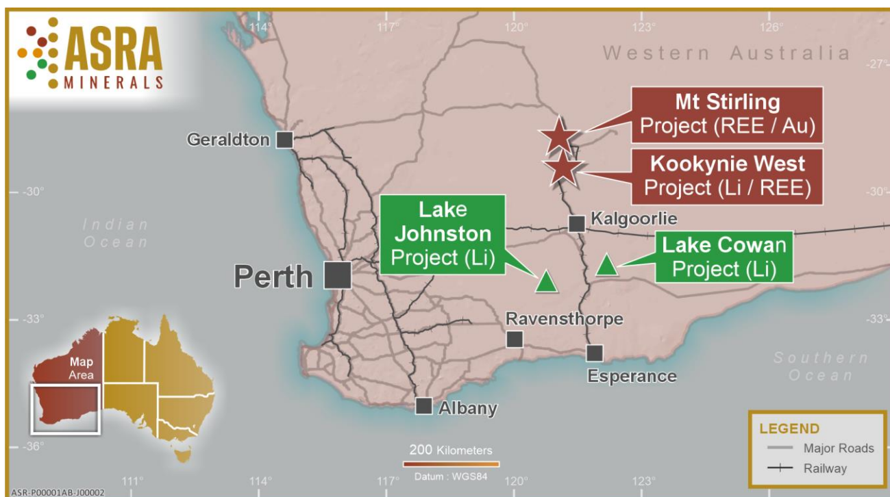
Figure 2. Location of Asra's Projects in Western Australia

Led by a strong and experienced team, Asra Minerals is focused on developing these prospective projects, with a view to meet rising global demand for REE and critical minerals.