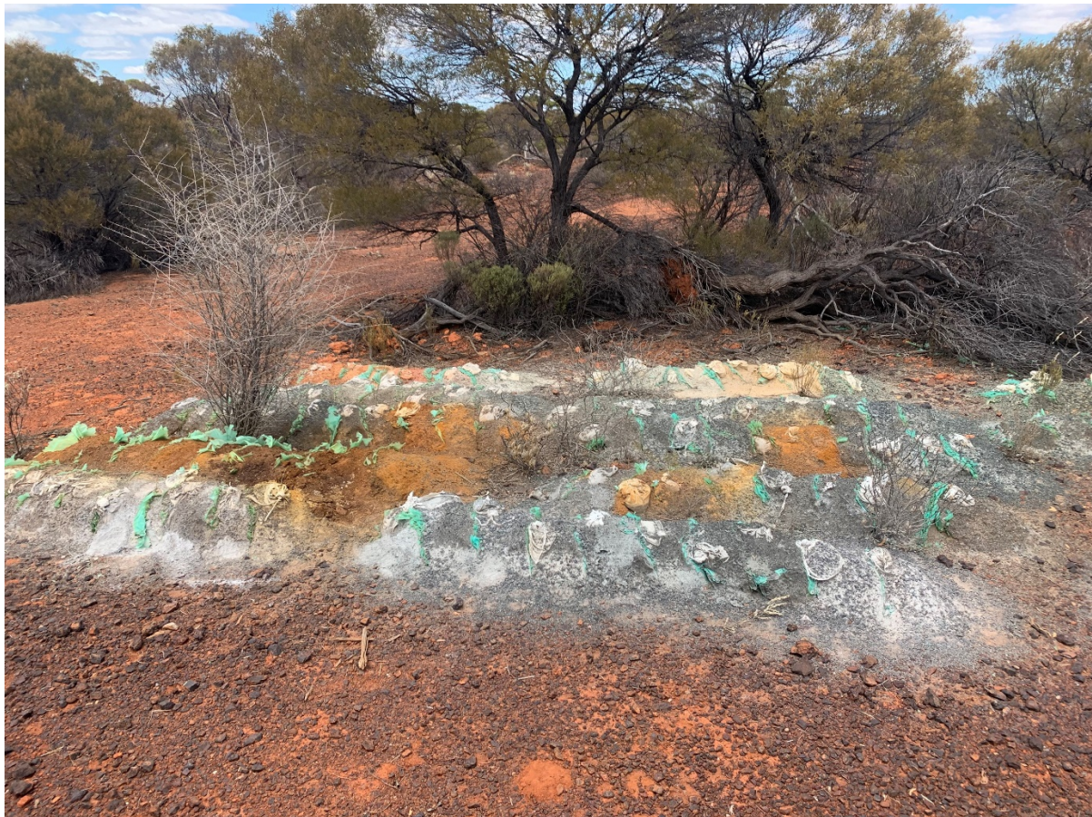
Figure 2: Significant quantities of sulphide mineralisation in drill spoils for hole KKRC0024 drilled by Rubianna Resources Ltd in 2013 (visible as brown limonitic weathering)

Two Dees is located approximately 5km south of Genesis' Ulysses gold deposit (838,000oz Au) and 3km south of Genesis' Admiral-Butterfly-Clark gold deposits (459,000oz Au). The tenement surrounds the Two Dees gold mine which historically is reported to have produced approximately 10,000t @ 19g/t Au, and is currently being operated by a private syndicate. Extensive laterite cover is present throughout the Two Dees tenement area with only minor outcrop present. Limited shallow RAB and air core drilling was undertaken historically with no significant gold results reported however the deeper potential for gold mineralisation remains untested.