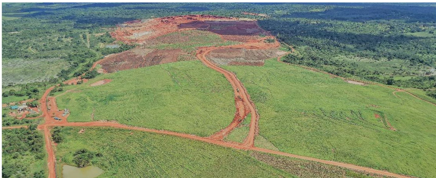
Image: Various stages of land rehabilitation on the Kwale Operations South Dune (foreground) following mining (background).

Rehabilitation activities on the mined-out areas of the South Dune continued in the quarter with community groups supplying indigenous legumes, grass seed and manure.