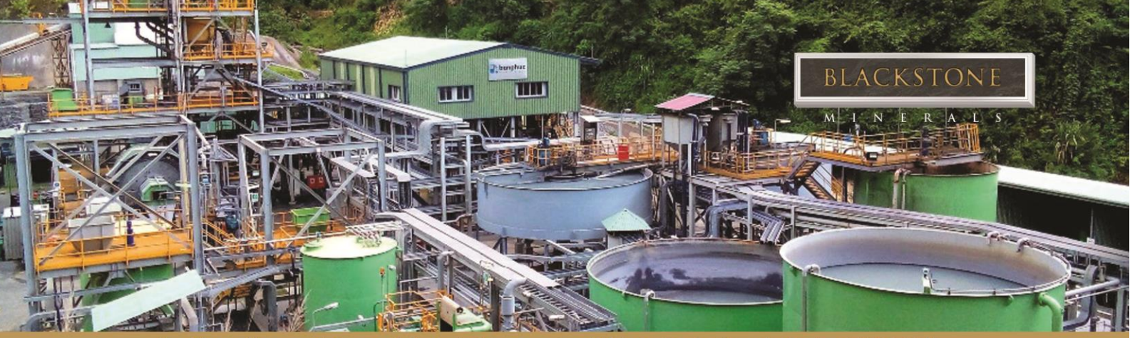
Positioned to meet demand from Asia's growing lithium-ion battery industry | ASX: BSX