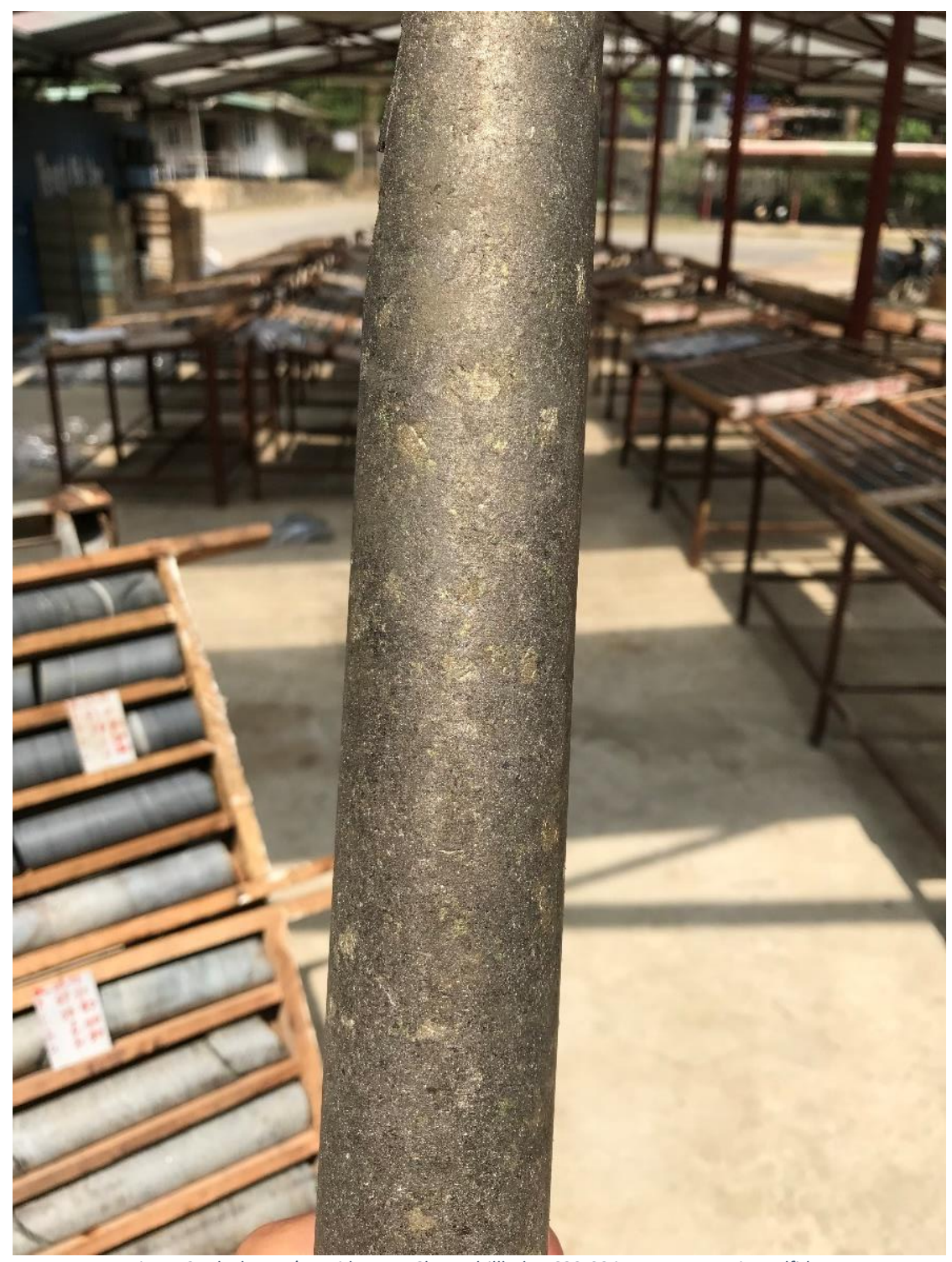
Figure 2: Blackstone's maiden Ban Chang drillhole BC20-03 intersects massive sulfide.

The drilling is part of an ongoing campaign to target regional MSV as Blackstone aims to build its resource inventory at Ta Khoa. Blackstone's second drill rig will continue to follow the in-house geophysics team throughout the Ta Khoa nickel sulfide district, testing high priority EM targets generated from 25 MSV prospects including King Snake, Ban Khoa, Ban Chang, and Ban Khang.