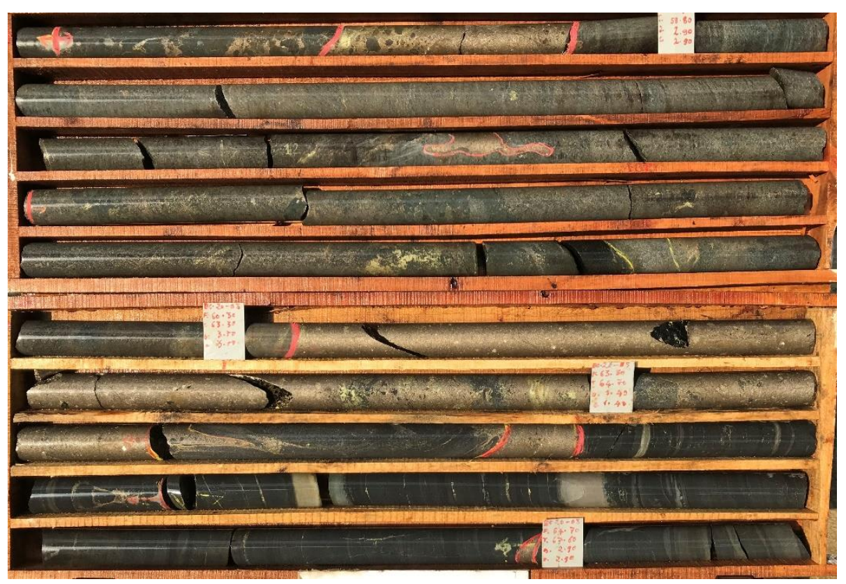
Figure 1: Blackstone's maiden Ban Chang drillhole BC20-03 intersects a 9.15m wide zone of sulfide vein mineralisation.