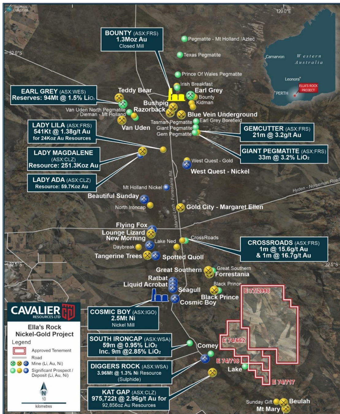
Figure 2: Ella's Rock Lithium Project and surrounding area

ASX Announcements referred to throughout Directors' Report