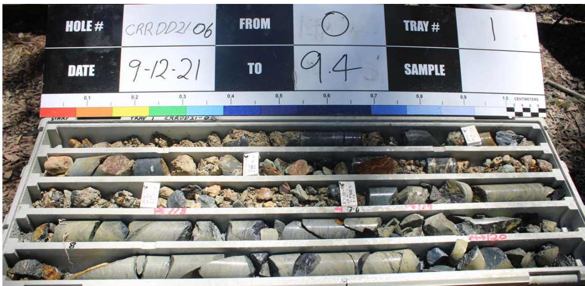
Figure 1: Diamond drill core showing (bottom three rows) part of a shallow polymetallic massive sulphide interval that extends from 7.7m-9.6m downhole - it is part of a broader highly mineralised zone of 5.3m (7.7m-13m downhole). The interval will comprise sphalerite (Zinc), galena (Lead-Silver) and chalcopyrites (Copper), (Diamond drill hole CRR21DD_06, Scale: NQ core 50mm diameter variety)

Critical Resources Managing Director Alex Biggs said: "To intersect Massive Sulphides on our second hole at Gibsons as well as our first hole is a great result. We're encountering strong mineralisation which we feel is indicative of what Halls Peak has to offer on a larger scale. We look forward to pushing on with our program and updating the market with more exciting results."