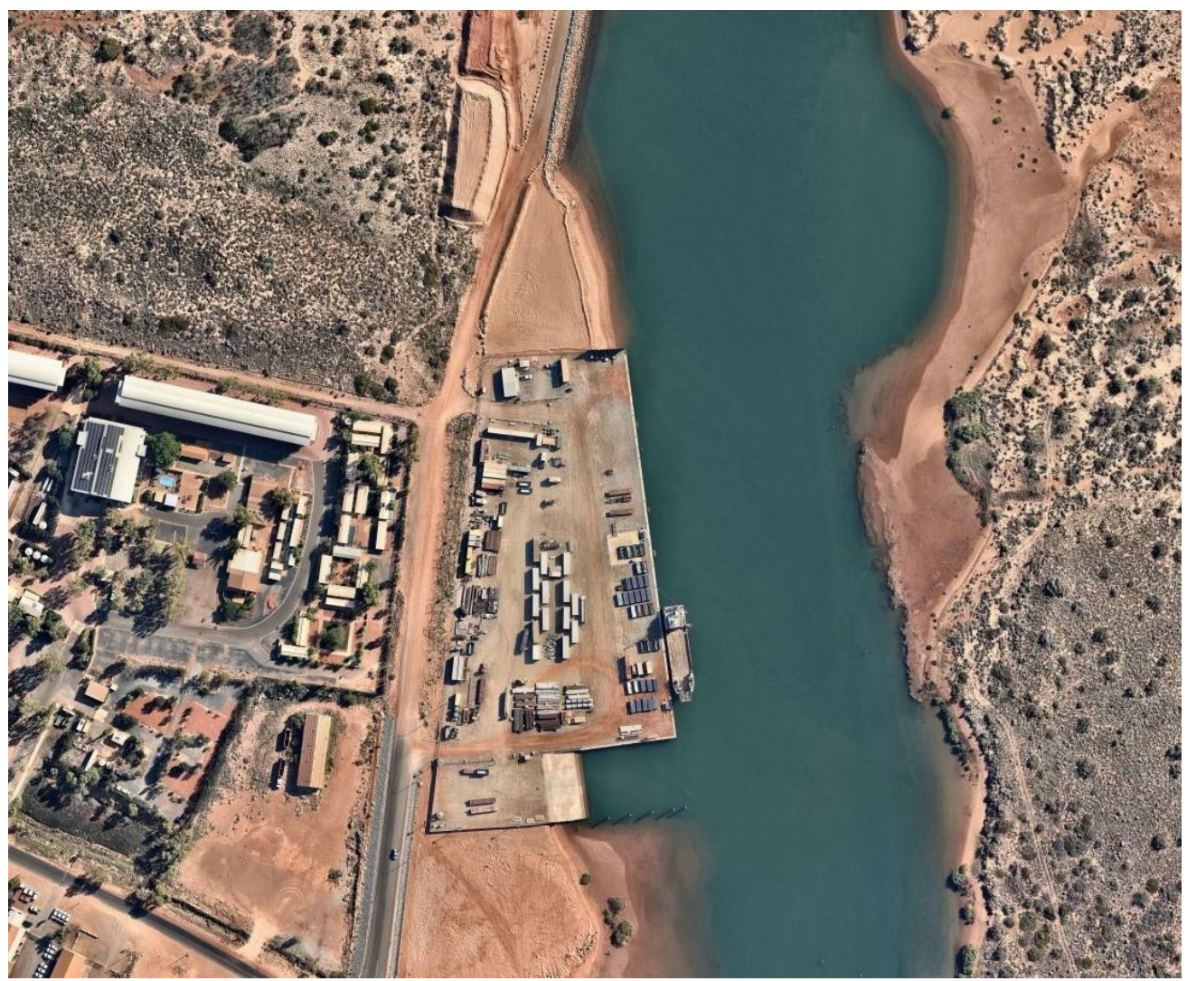
Figure 3 More recent vertical aerial photograph of the OMSB Facility with a vessel dock-side.