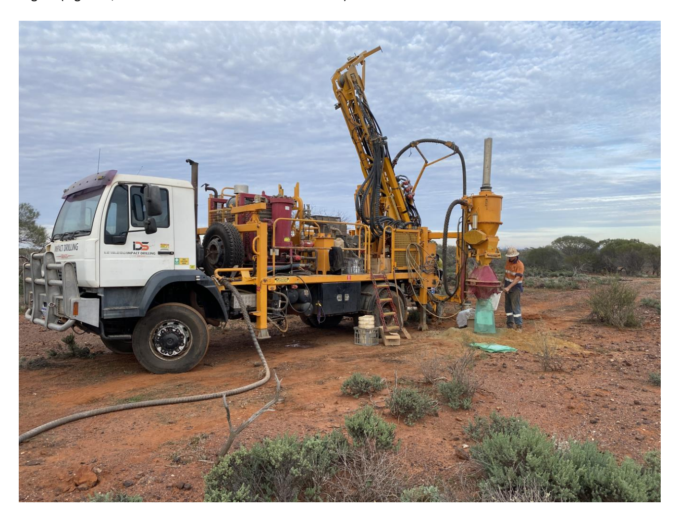
Figure 1 Slim-line RC rig commencing the Buddadoo drilling programme.

CZR Resources Limited (ASX:CZR) is pleased to announce that it has started an RC drilling campaign of up to 5,000m on seven priority targets along the Salt Creek Shear in the Gullewa Greenstone Belt in WA's Mid West region (Figure 1; CZR release to the ASX 31 March 2021).