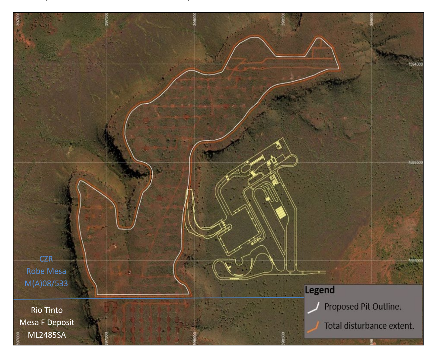
Figure 2. CZR's Robe Mesa mining footprint and proposed processing and support infrastructure – Rio Tinto Mesa F deposit immediately south

The company has also made significant advancements in its ambitious strategy to grow mine life and production rates at Robe Mesa, with the recent Mineral Resource increase to 45.2Mt (ASX announcement 12 December) and acquisition of the FMG tenement, expanding CZR's P529 deposit, located only 5km from Robe Mesa (ASX announcement 20 December 2022).