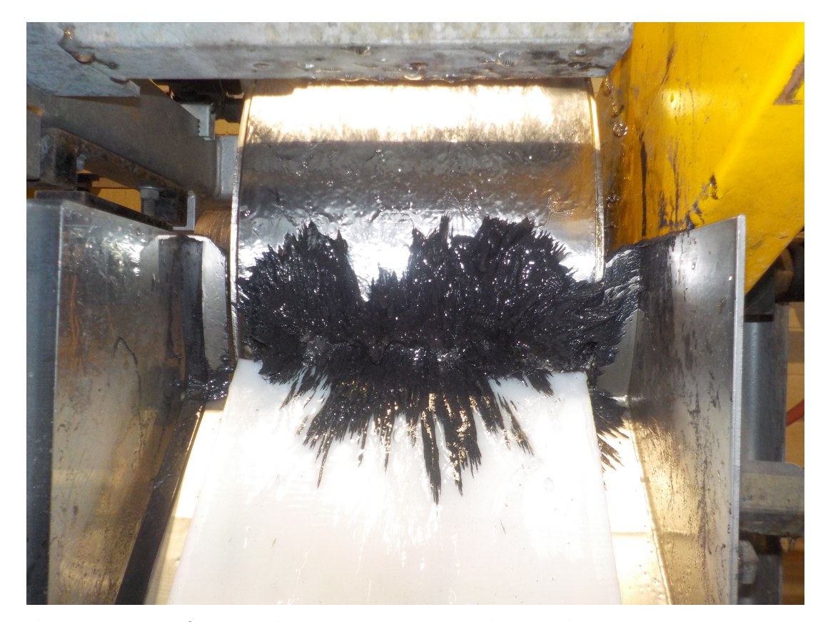
Plate 3 – Magnetite from Sigatoka samples being recovered during pilot plant tests