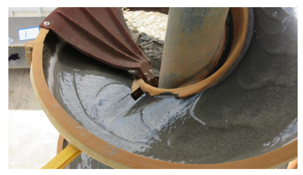
Plate 2 – Darker heavy minerals (including magnetite) are concentrated toward the centre of the spirals, where they are separated for recovery.