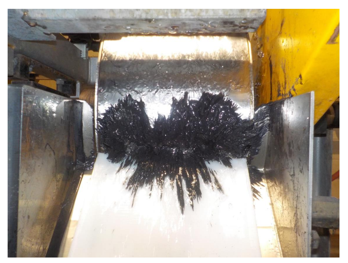
Plate 3 - Titano-magnetite from Sigatoka bulk samples being recovered in a Low Intensity Magnetic Separator test (LIMS).