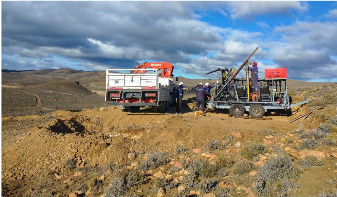
Figure 1: Prospect 37A – drill platform and rig