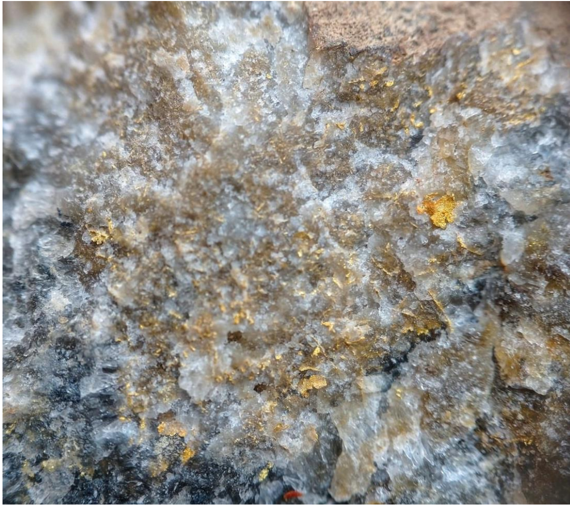
Figure 3: Trench ROT-009, visible gold in hand sample (x10 magnification)