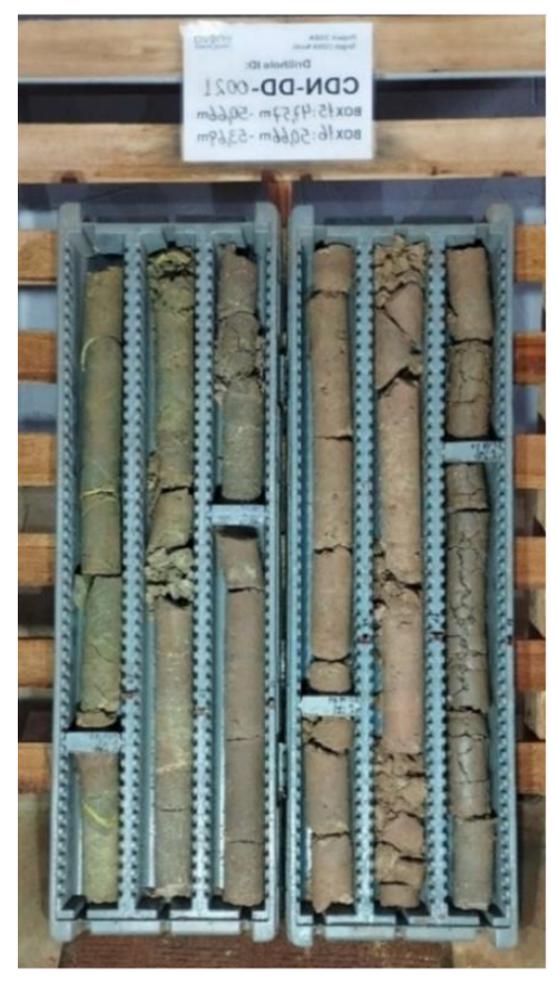
Figure 3: Diamond drill core within saprolite and saprock representing kamafugite litho-unit.