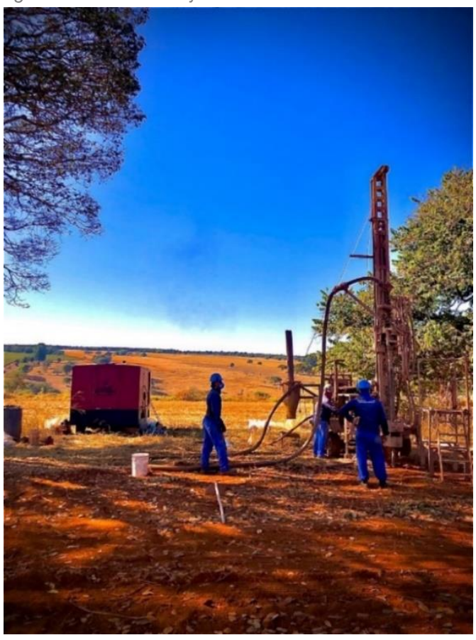
Figure 1: Reverse circulation drill rig in the backdrop of vast pastureland of CODA North.