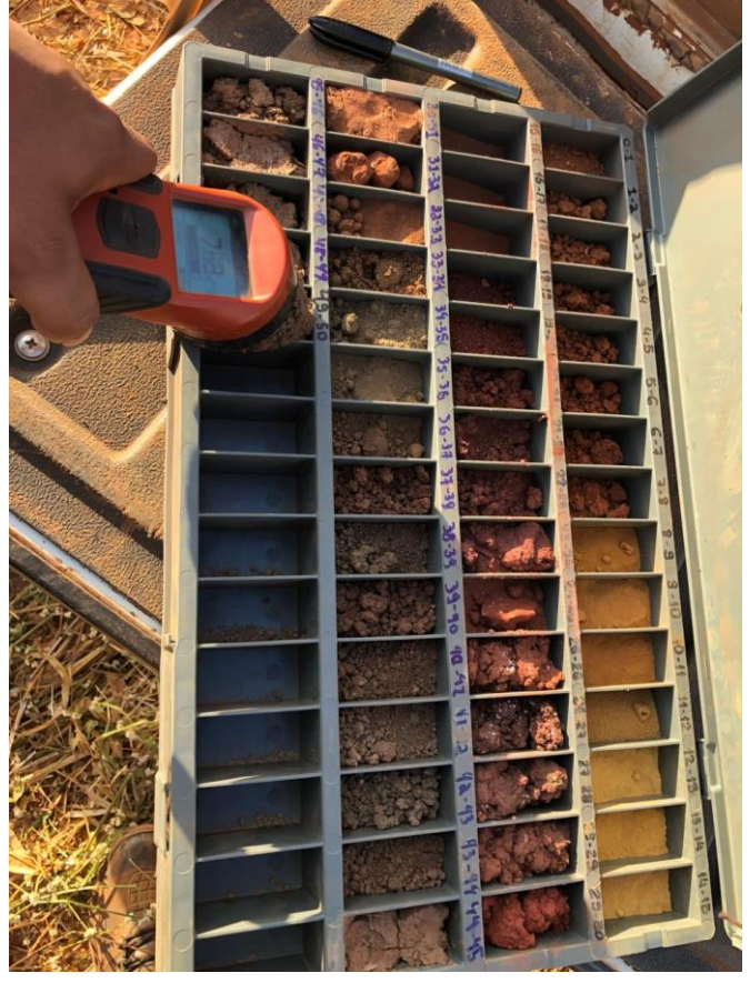
Figure 2: Enova's geologist checking magnetic susceptibility of saprolite drill cuttings during logging.