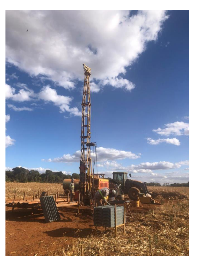
Figure 4: Enova's diamond core samples are being stored in the diamond core box.