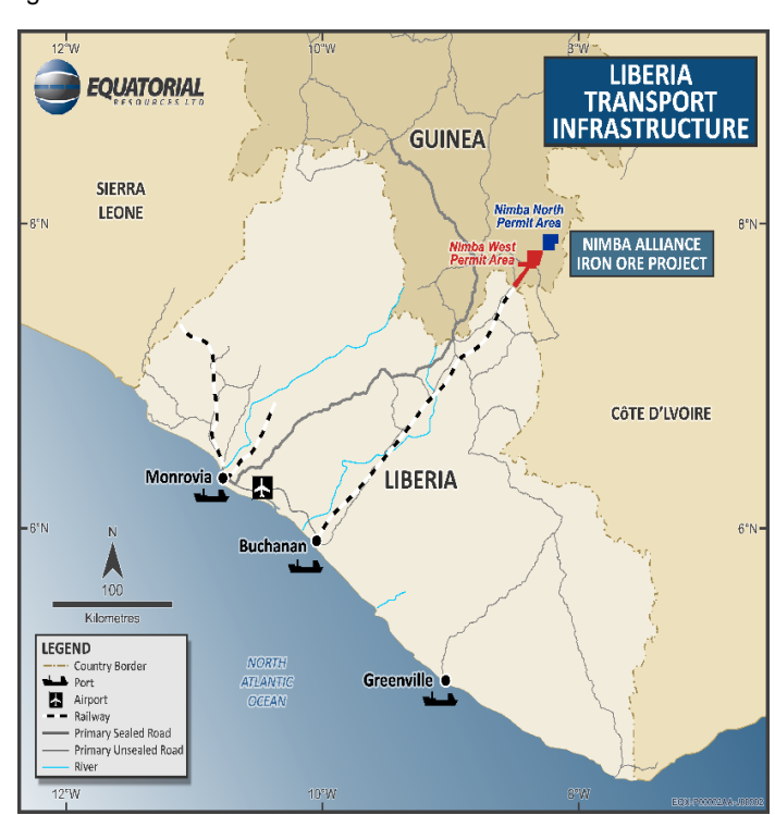
Figure 2 – Liberian Transport Corridor