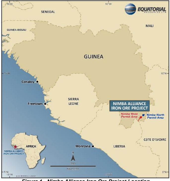
Figure 1 - Nimba Alliance Iron Ore Project Location

The Nimba Project is a prospective and potentially large-scale iron ore project located in Guinea, West Africa which was acquired by Equatorial in July 2023. The Nimba Project is located within a cluster of major iron ore projects. The Nimba Project covers a large landholding in Guinea's prolific Nimba Iron Ore Corridor and comprises majority ownership of two permits: 100% of the Nimba West permit covering ~198km²; and 56% of the Nimba North permit covering ~107km².