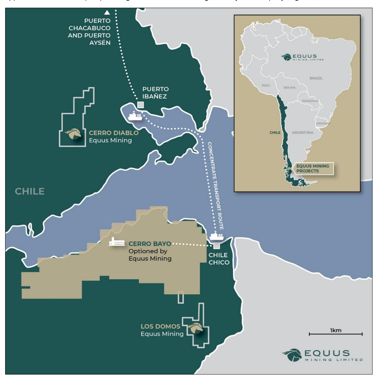
Figure 2 – Location plan of Equus Mining's Cerro Bayo mining district and other projects.

The Company's Flagship Cerro Bayo Project is held under a 3-year option to acquire 100% of all the Project's mining properties, resources and mine infrastructure from Mandalay Resources Corporation<sup>3</sup>. The project contains an existing 1,500 tpd processing plant through which historical production of 645Koz Gold and 45Moz Silver<sup>4</sup> was achieved up until the mine's temporary closure in mid-2017. The Cerro Bayo Project is located central to the approximate 350km<sup>2</sup> of prospective gold-silver claim holdings held by the company (Figure 2).