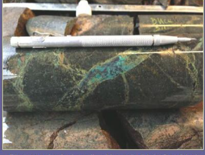
Photograph of mineralized breccia (Hole 2 at 61m)