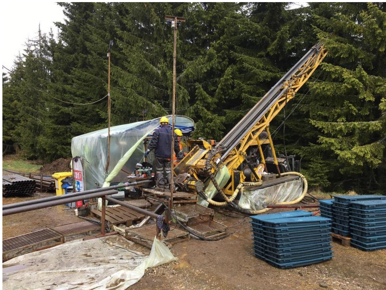
Figure 1: Drill Rig I - in operation

mapping of the drill core, as well as assays at the Company's external lab in Ireland. All data have been collected into a common database to update the geological block-model to upgrade and increase JORC compliant resource as anticipated. The block model update is in progress and is expected to be reported in Q4/2021.