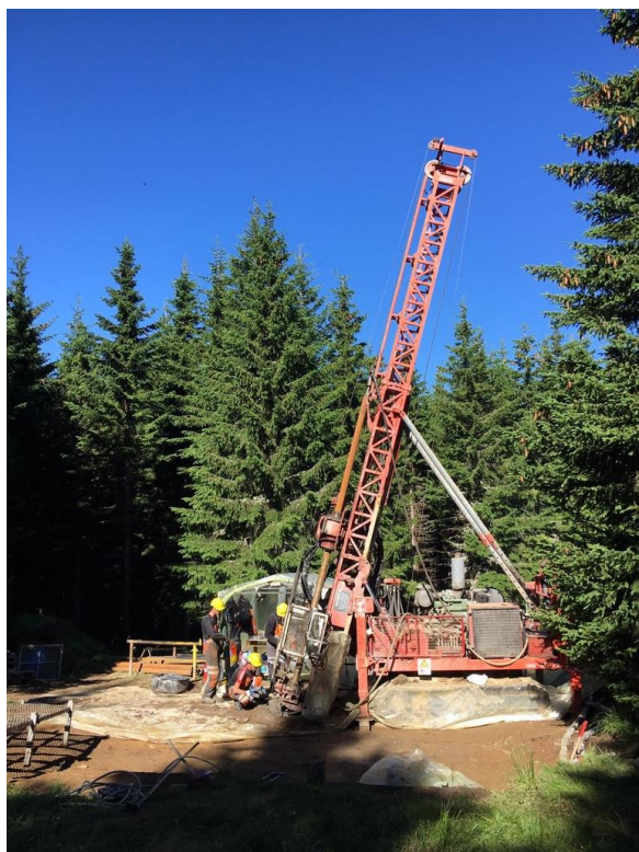
Figure 2: Drill Rig II - in operation

The Company has worked with their DFS-team, based in Europe, South Africa and Canada covering geology, mining and scheduling, ore concentration and metallurgy with conversion as well as structural design work, marketing, financial planning and scheduling covering future CAPEX and OPEX for the operations. The final team for the aforementioned areas of expertise has been nominated and DRA Global was nominated as the leading contractor to manage the DFS on behalf of the Company.