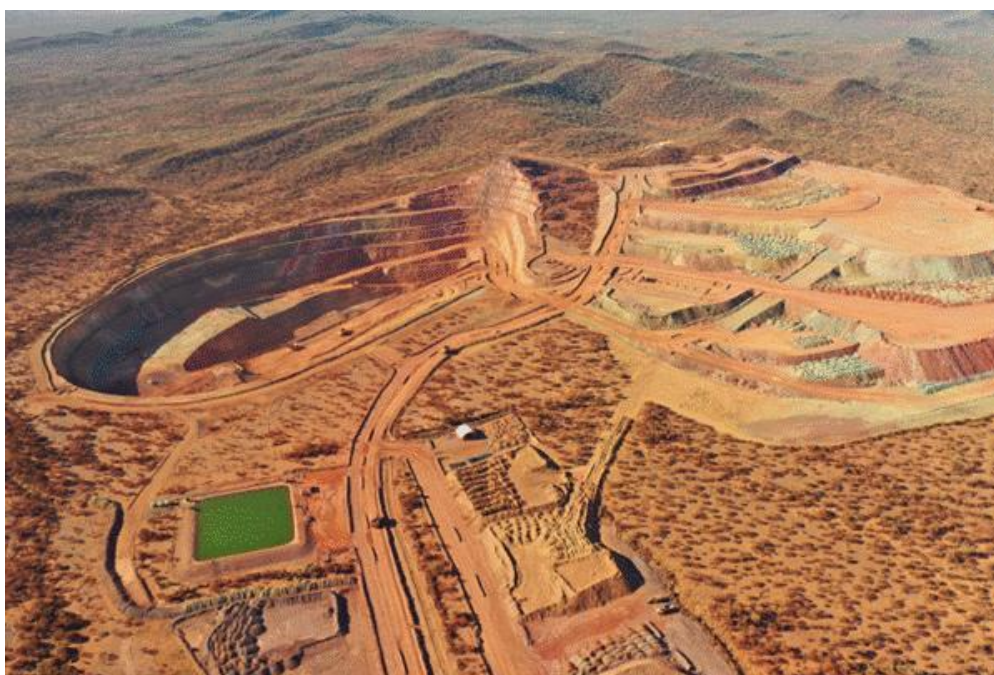
Fenix's 100% owned Iron Ridge Iron Ore Mine – March 2024

The Iron Ridge C1 operating margin, not including hedging and quotation period adjustments, for the March Quarter was A$95/dmt. The C1 operating margin is calculated as the Average Realised FOB price less C1 Cash Costs, calculated on an equivalent dmt basis for the period.