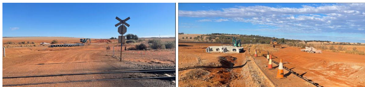
Ruvidini Inland Port Construction – March 2024

The development of Ruvidini as an inland port provides Fenix the ability to moderate the timing surrounding tonnages shipped through Fenix's Geraldton Port facilities, improving efficiency by reducing bottlenecks and providing storage of iron ore materials for minimal cost. Fenix intends to work in partnership with Main Roads to rehabilitate and commission the Ruvidini Rail Siding, including associated road works. Fenix is exploring future opportunities to extend the Company's logistics offering to include rail haulage solutions as a means to bolster future revenue opportunities for both Fenix-owned product as well as third-party producers seeking to export through the Port of Geraldton.