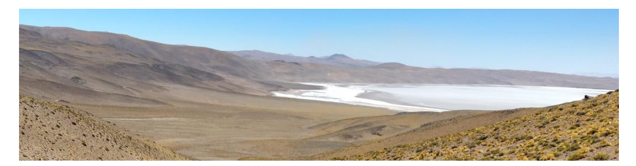
HMW Project looking north from Pata Pila

Greenbushes South Lithium Project: Galan has an Exploration Licence application (E70/4629) covering a total area of approximately 43 km2. It is approximately 15kms to the south of the Greenbushes mine. In January 2021, Galan entered into a sale and joint venture with Lithium Australia NL for an 80% interest in the Greenbushes South Lithium project, which is located 200 km south of Perth, the capital of Western Australia. With an area of 353 km2, the project was originally acquired by Lithium Australia NL due to its proximity to the Greenbushes Lithium Mine ('Greenbushes'), given that the project covers the southern strike projection of the geological structure that hosts Greenbushes. The project area commences about 3km south of the current Greenbushes open pit mining operations.