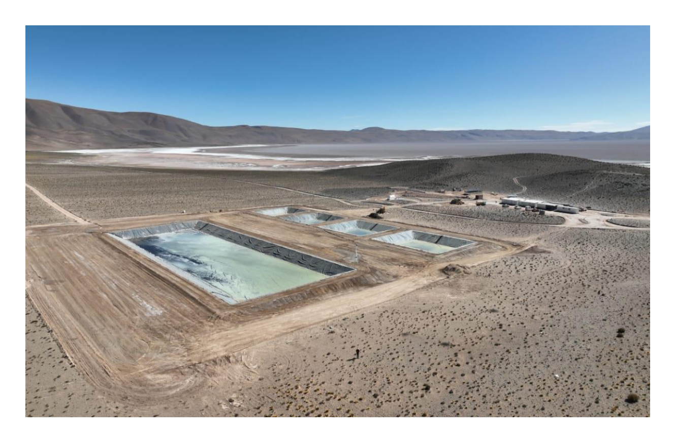
Figure 3 – Aerial view of S1 pond filling with brine with camp and the Hombre Muerto salt flat in the background. Evaporation testing ready to commence.

This is a major milestone given that it marks the commencement of large-scale piloting activities at the HMW Project. The data set to be obtained from this initial evaporation trial will allow the calibration of the simulation model to predict the completion time for achieving the first batch of brine concentrate with 6% of Li contents produced by the Pilot Plant.