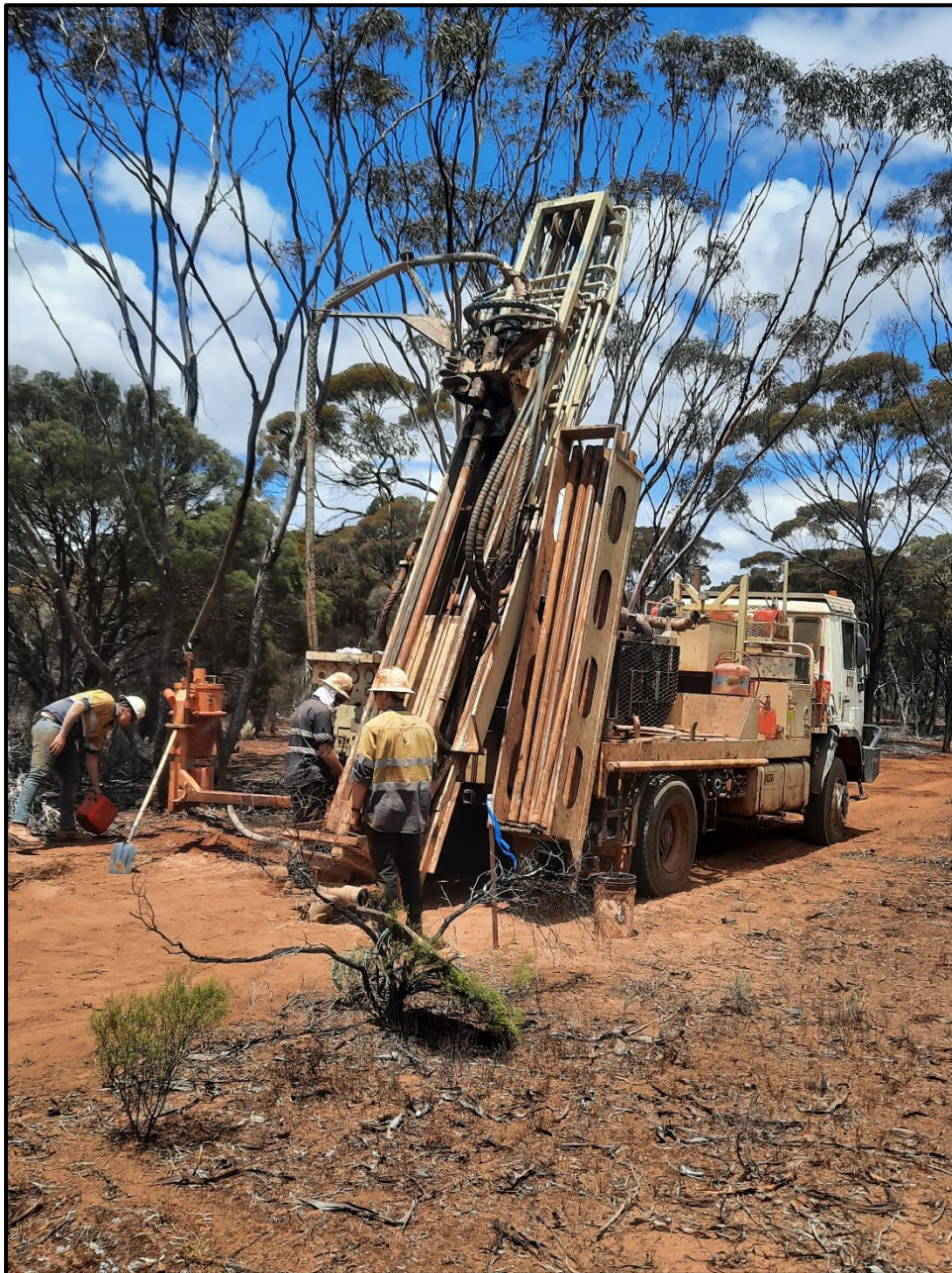
Fig 1: Air core drilling underway at the Norseman Project in Western Australia.

With a healthy ~$12 million cash balance, Galileo remains in a strong financial position ensuring we are fully funded to undertake all planned activities and able to maintain our focus of advancing exploration efforts and unlocking value at Norseman."