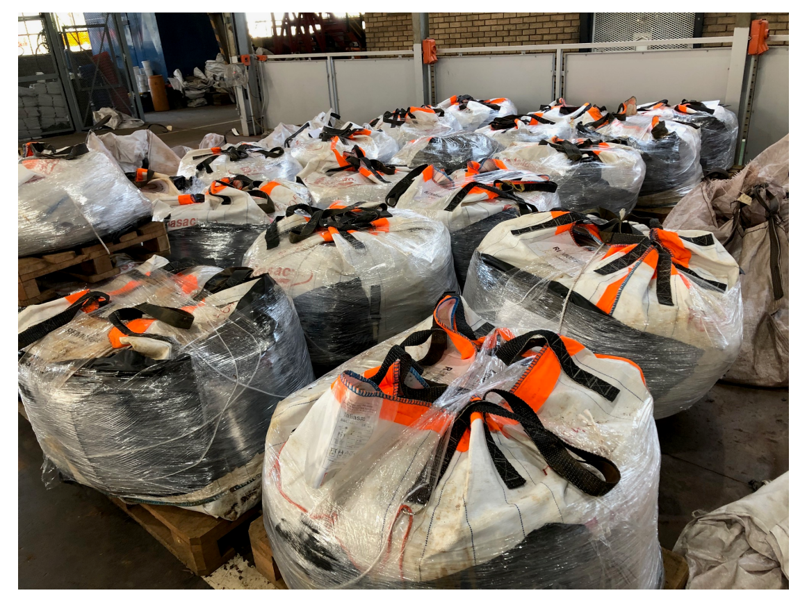
Figure 3: Representative Bulk DID & Oxide Samples from Baniaka