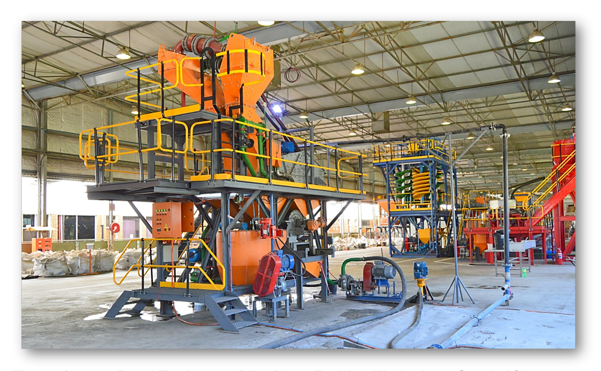
Figure 4: Bond Equipment Pilot Plant Facility, Klerksdorp, South Africa