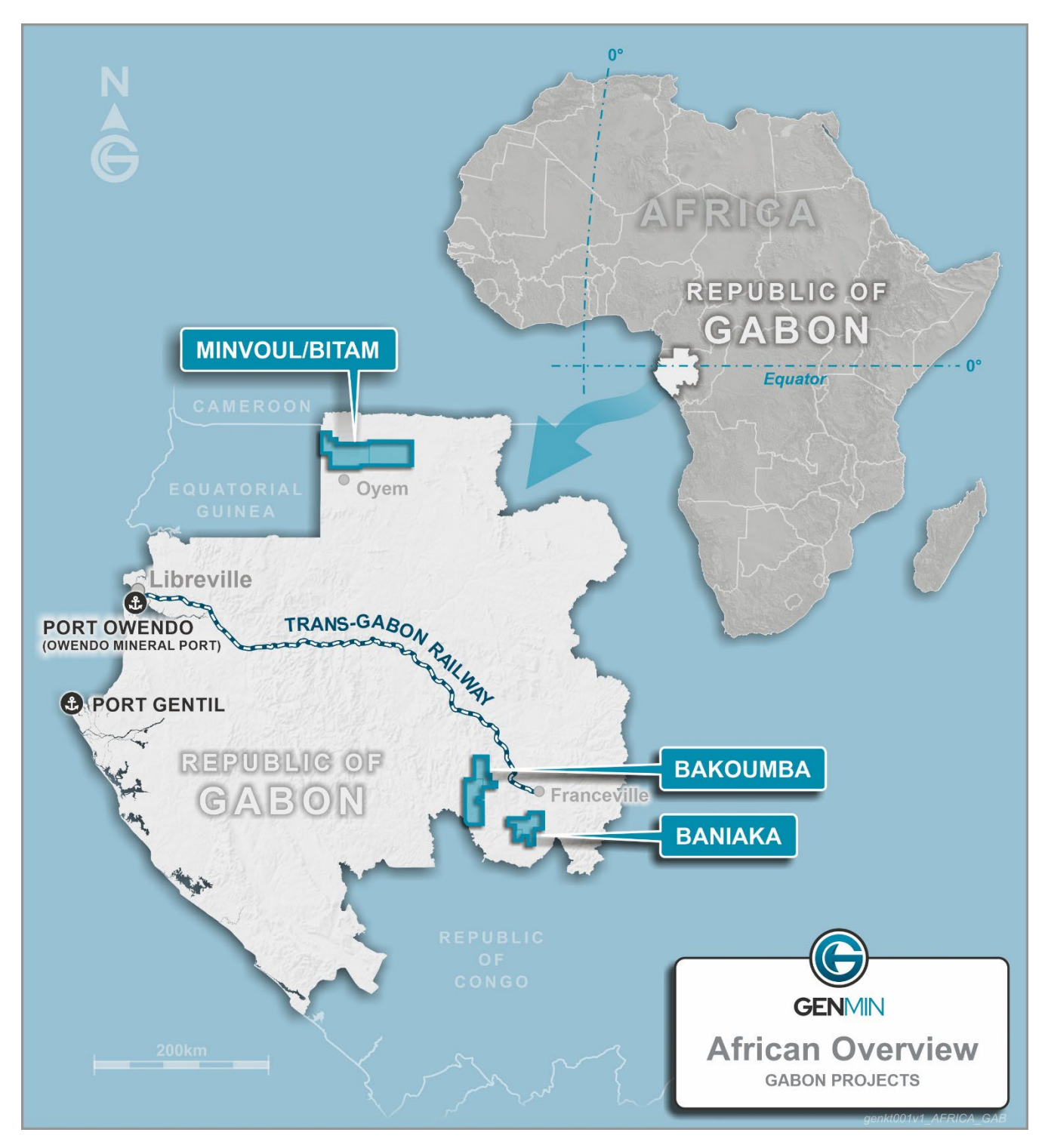
Figure 1: Location map of Genmin's iron ore projects in Gabon, central West Africa