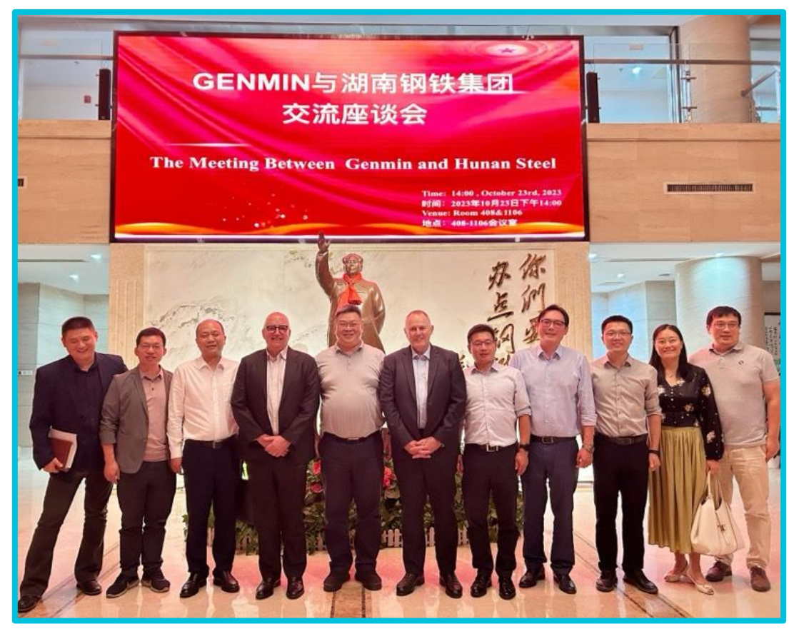
Figure 2: Genmin delegation in China, meeting with Hunan Steel, October 2023