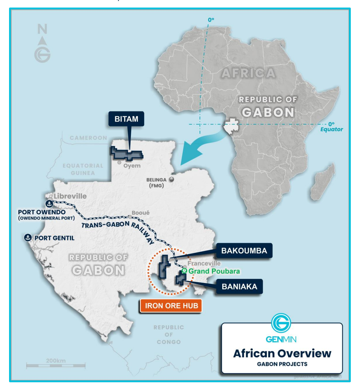
Figure 1: Location map of Genmin's projects in Gabon

The Company confirms that it is not aware of any new information or data that materially affects the information included in the original market announcement, that all material assumptions and technical parameters underpinning the estimates of Mineral Resources and Ore Reserves in the market announcement above continue to apply and have not materially changed, and that the form and context in which the Competent Persons findings are presented have not been materially modified.