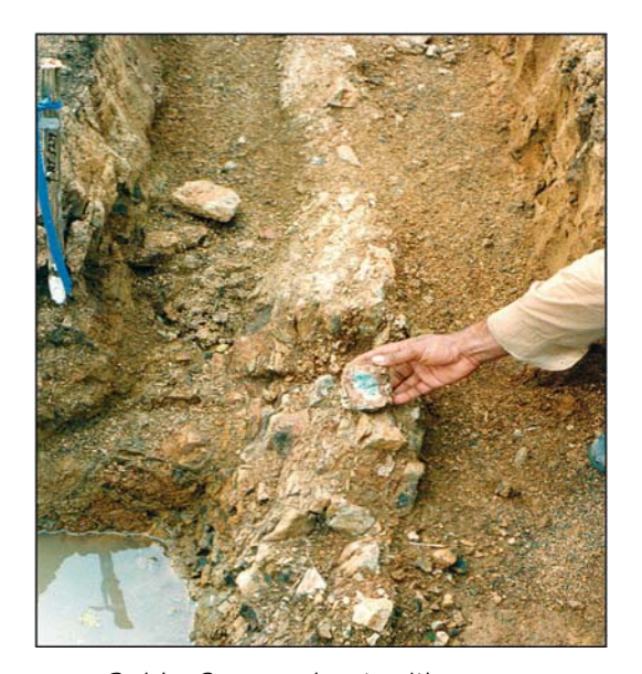
Gold - Copper shoot, with a green cupriferous hand specimen