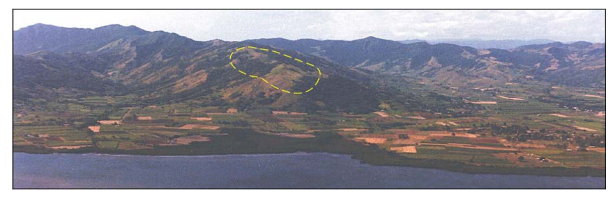
Aerial View of Tataiya Ridge (rises to 330m). The area of anomalous gold is outlined in yellow.