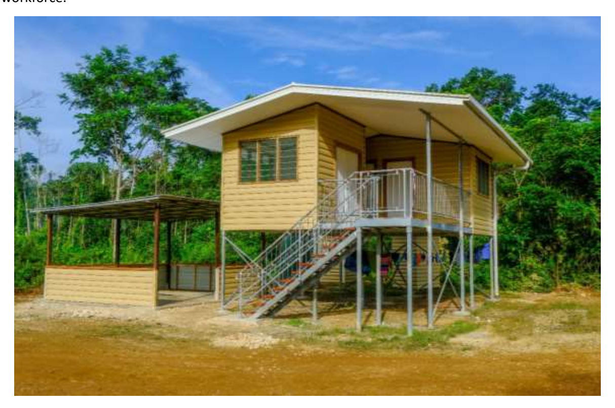
Figure 6: Recently completed community relocation house

The revised 'self-perform' approach has delivered cost reductions, improvements in workforce productivity, high quality construction outcomes and a sustained level of commitment from the local workforce.