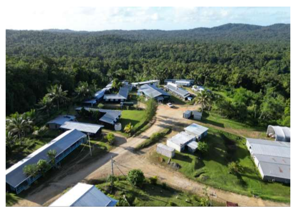
Figure 3: Woodlark camp and office infrastructure