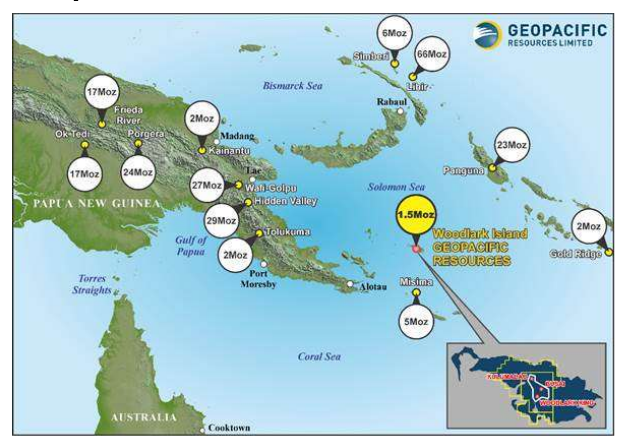
Figure 1: Woodlark's regional setting – the "Pacific Ring of Fire"

The Woodlark Gold Project ( the Project ) is an advanced gold development project, located on Woodlark Island in Papua New Guinea ( PNG ). The Project has current endowment of 1.5 million ounces of gold in Mineral Resources<sup>1</sup>.