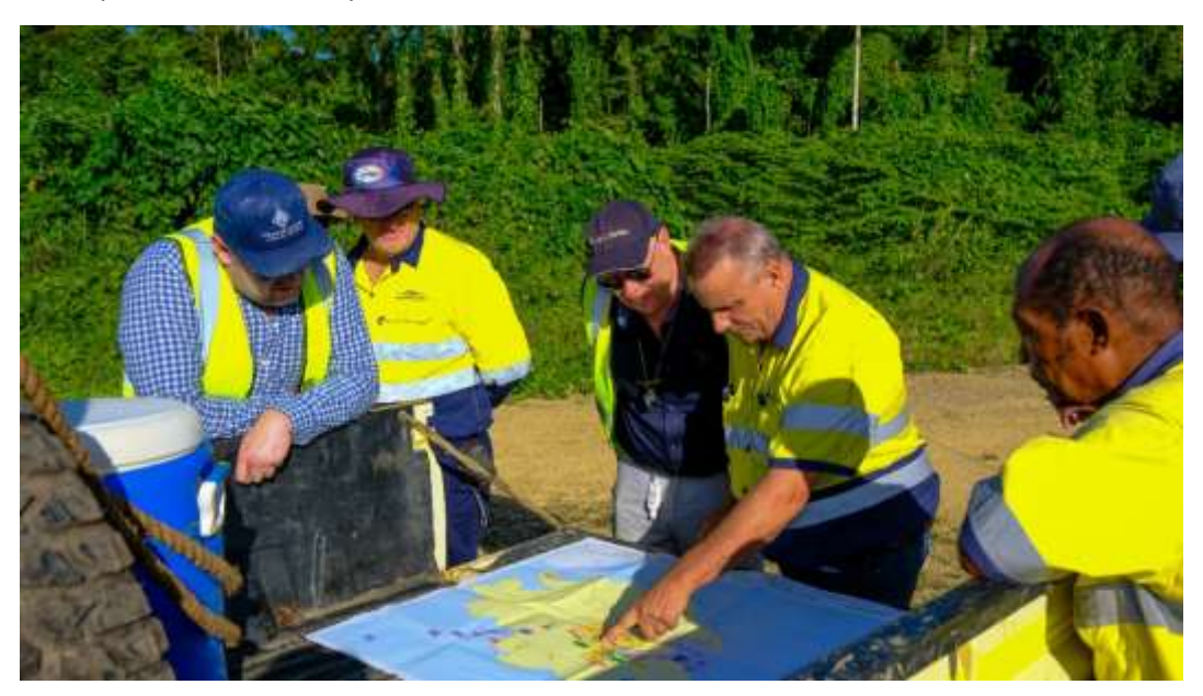
Figure 2: Woodlark site visit – June 2023

During the period, Orange Mining, an experienced project development group, was appointed to provide Geopacific with a 'ready-made' owners team.