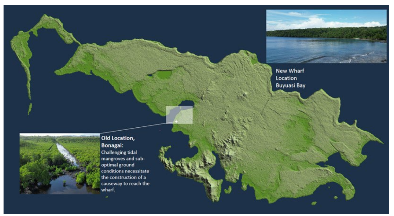
Old and proposed new wharf locations

The revised wharf location reduces the challenges associated with construction through the Bonagai mangroves and eliminates the requirement for a dedicated road out to the marine facility. Preliminary assessments of wave and bathymetry data support suitability of the wharf at Buyuasi Bay.