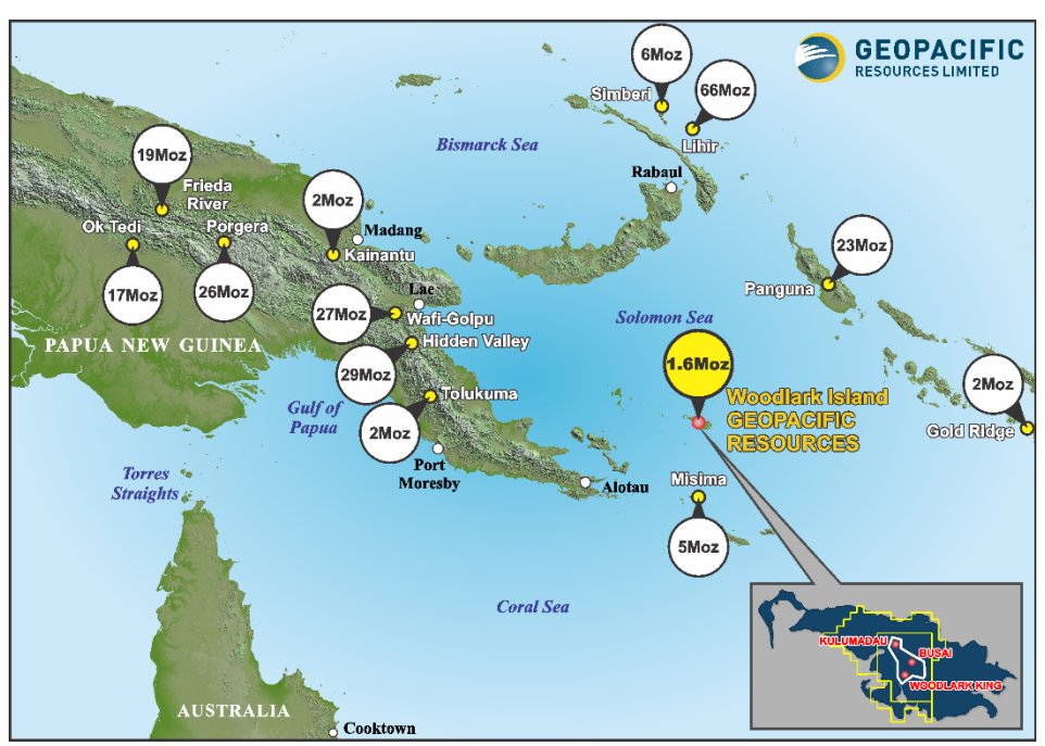
Woodlark's regional setting – the "Pacific Ring of Fire"

Key Project permits are in place and Geopacific Resources Limited ( Geopacific or the Company ) is positioned to leverage off extensive previous investment in drilling, development studies, assets and infrastructure.