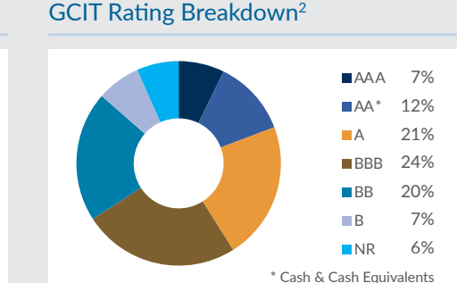
<sup>2</sup> Excludes Manager Loan