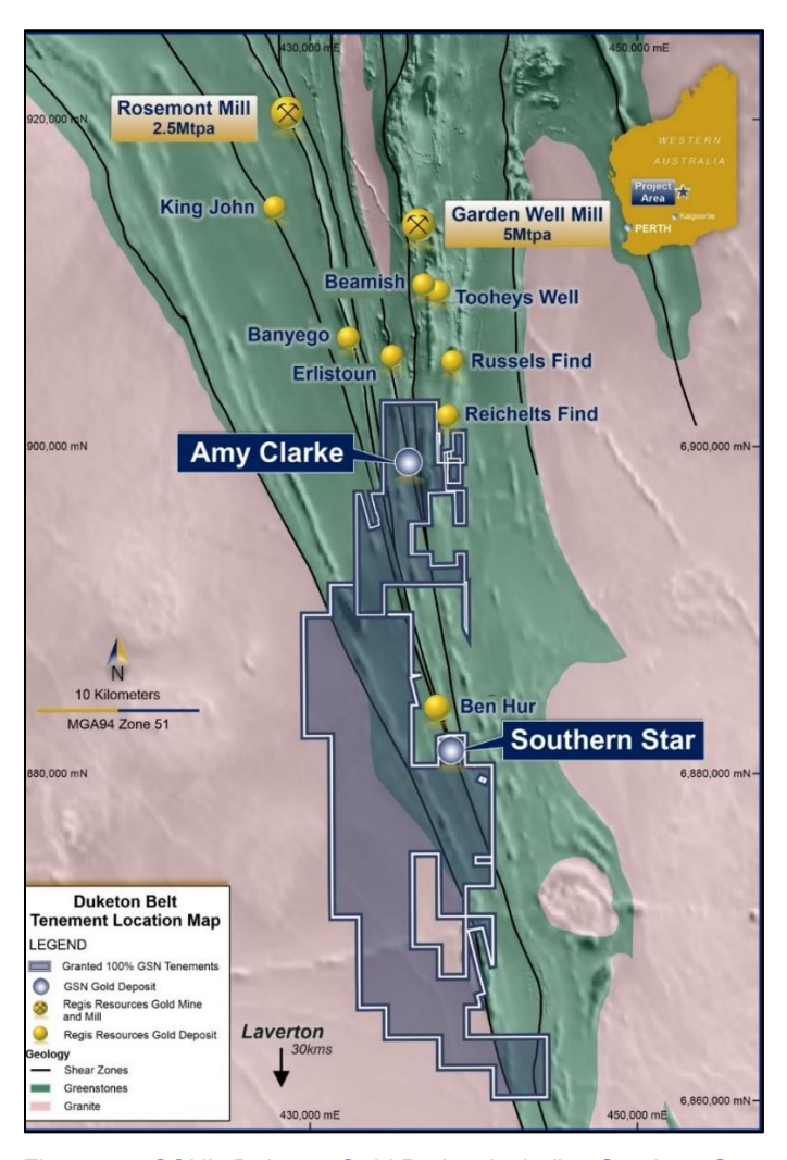
Figure 2 – GSN's Duketon Gold Project including Southern Star.

Importantly, the area to the north and south of the known mineralisation footprint has seen little to no historical exploration activities. Once the mineralised corridor is defined by geochemistry, RC drilling will be planned to target the corridor along strike into fresh rock where the bulk of the gold mineralisation persists at Southern Star.