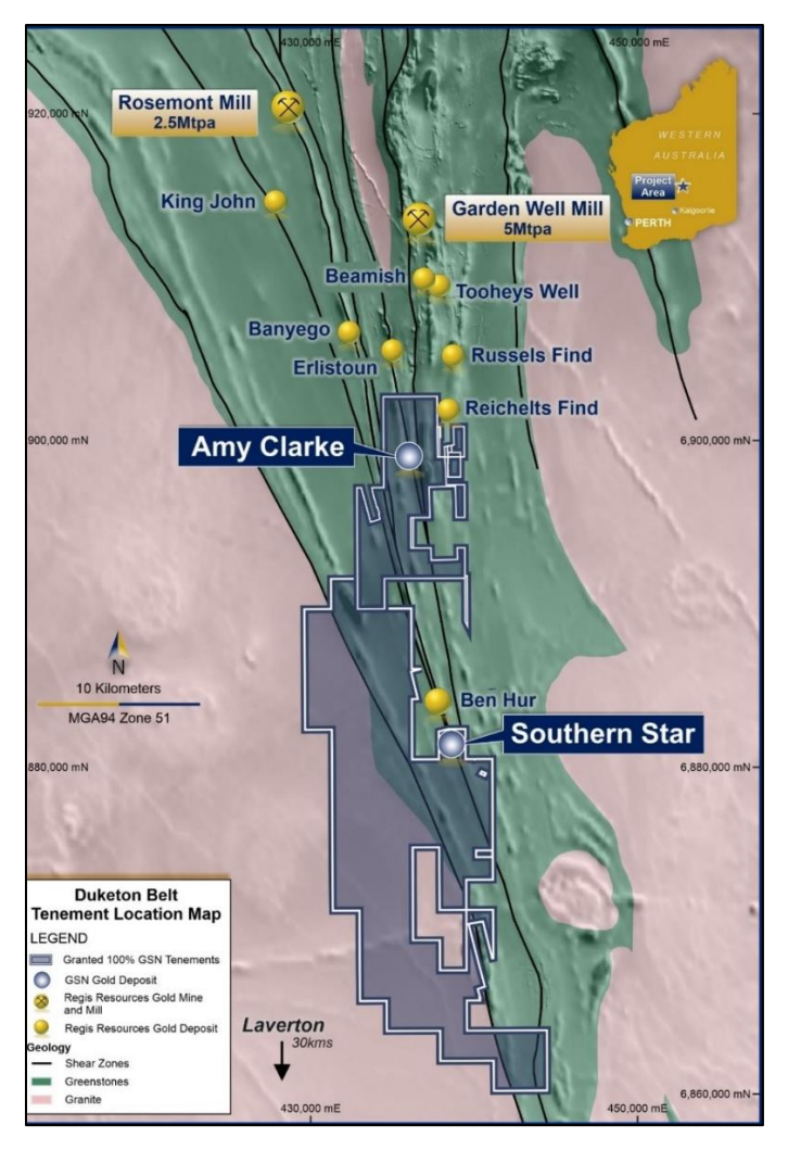
Figure 3 – GSN's Duketon Gold Project including Southern Star.

This announcement is authorised by the Executive Chairman on behalf of the Board of GSN.