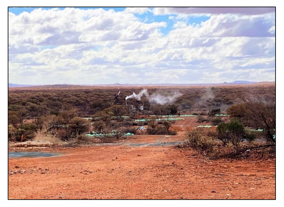
Figure 1 – RC rig operating at Southern Star (photo looking north).