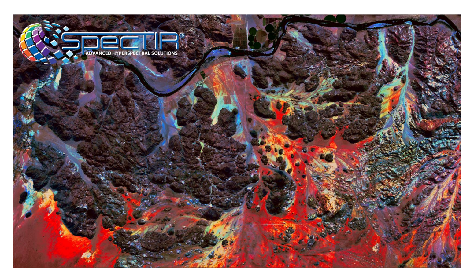
Figure 2: Example of hyperspectral imagery – Richtersveld World Heritage Site, South Africa – 3.0m GSD

Hyperspectral mineral mapping is capable of detecting the hydrothermal alteration associated with epithermal mineral systems and has proven to be an effective technique in differentiating minerals systems at Mt Carlton which is located between the two projects. The survey will provide project-scale, high resolution base map image mosaics that will define various alteration zones over whole of project delivering an unprecedented view of the underlying geology and mineralogy across a greenfields area.