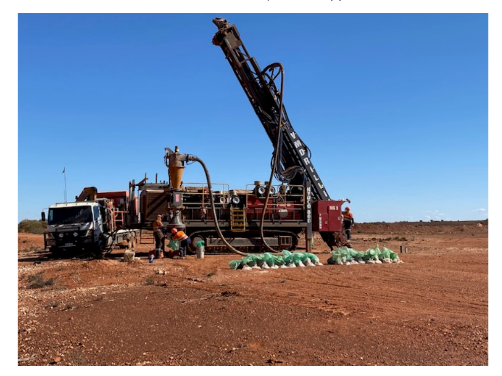
Figure 1: RC Drilling Rig on site at Gum Creek Gold Project

The drilling program will comprise a total of 38 RC holes for 4,680 metres. The program will consist of infill and extensional drilling to improve definition of the modelled mineralisation and to target extensions to the Swan and Swift Mineral Resource (refer to Appendix 1 for further details).