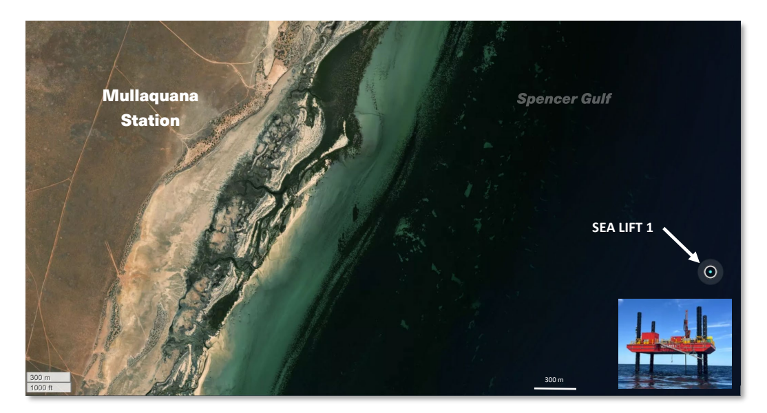
Locality of Jack Up Barge (JUB) SEA LIFT 1 at Mullaquana, progressing various offshore geotechnical drillholes for the proposed Northern Water desalination plant (position on 24 April 2025)

A second JUB is still progressing offshore geotechnical drillholes at Mullaquana. These investigations extend further into the Spencer Gulf than those at Cape Hardy.