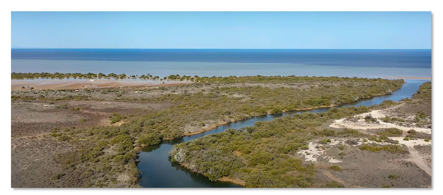
Terrestrial and marine environment, Mullaquana Station coastal zone, Upper Spencer Gulf

According to latest information on the Northern Water website, "Extensive studies have been undertaken at Cape Hardy, approximately 200km from Whyalla, and Mullaquana Station, approximately 20km south of Whyalla. A final decision on the preferred desalination plant location is expected in 2025 once sufficient information has been gathered at both sites and in the lead up to a final investment decision. A range of considerations such as technical, environment, cultural heritage, socio-economic impacts and benefits, project schedule, and cost will be considered in making the final site decision."