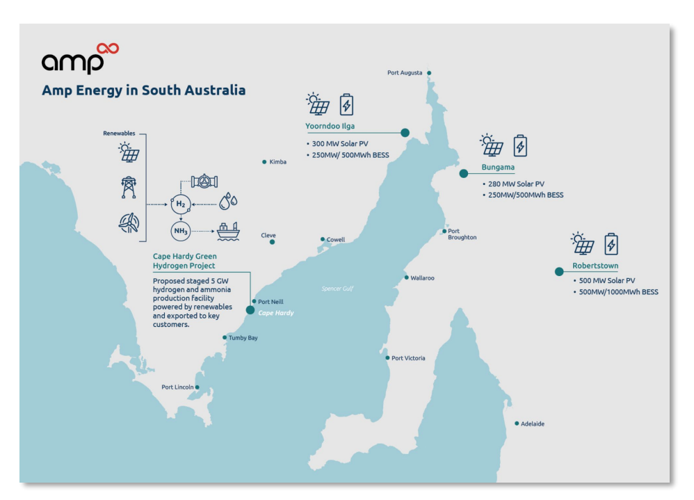
Amp Energy renewable energy projects in South Australia

Amp's Cape Hardy Green Hydrogen project website provides general project information as well as detailed fact sheets relating to the met masts and the Renewable Energy Feasibility Permit (REFP) regulatory process. The Government of South Australia's Department for Energy and Mining (DEM) notes Amp's REFP application was lodged on 9 December 2024.