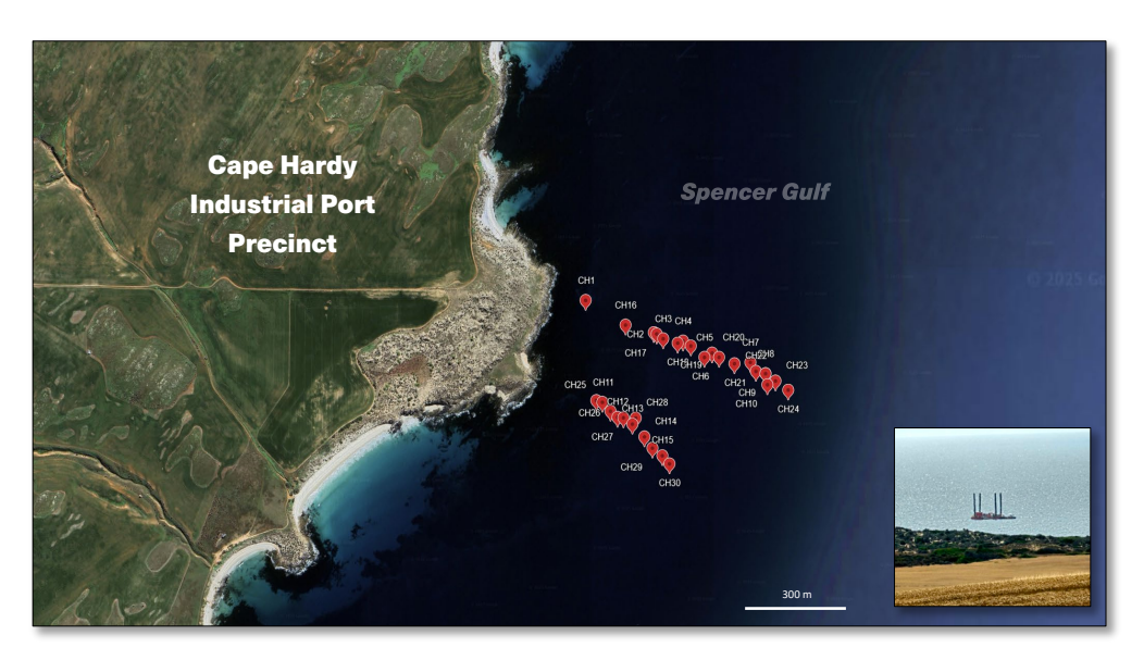
Locality of completed offshore geotechnical drillholes at Cape Hardy, aligning with the proposed intake and outfall tunnels for the proposed Northern Water desalination plant

By the end of the quarter, a Jack Up Barge (JUB) at Cape Hardy had completed all offshore geotechnical drillholes on behalf of Northern Water. These holes define the proposed intake and outfall tunnels.