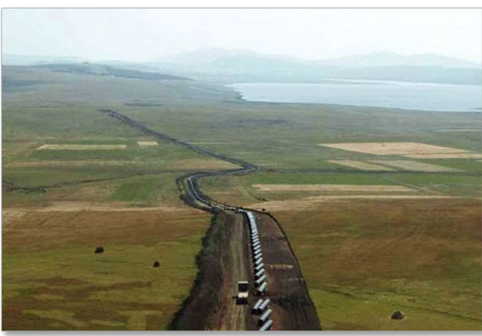
Pipeline construction within terrain similar to that traversed by the CEIP infrastructure corridor on the Eyre Peninsula.