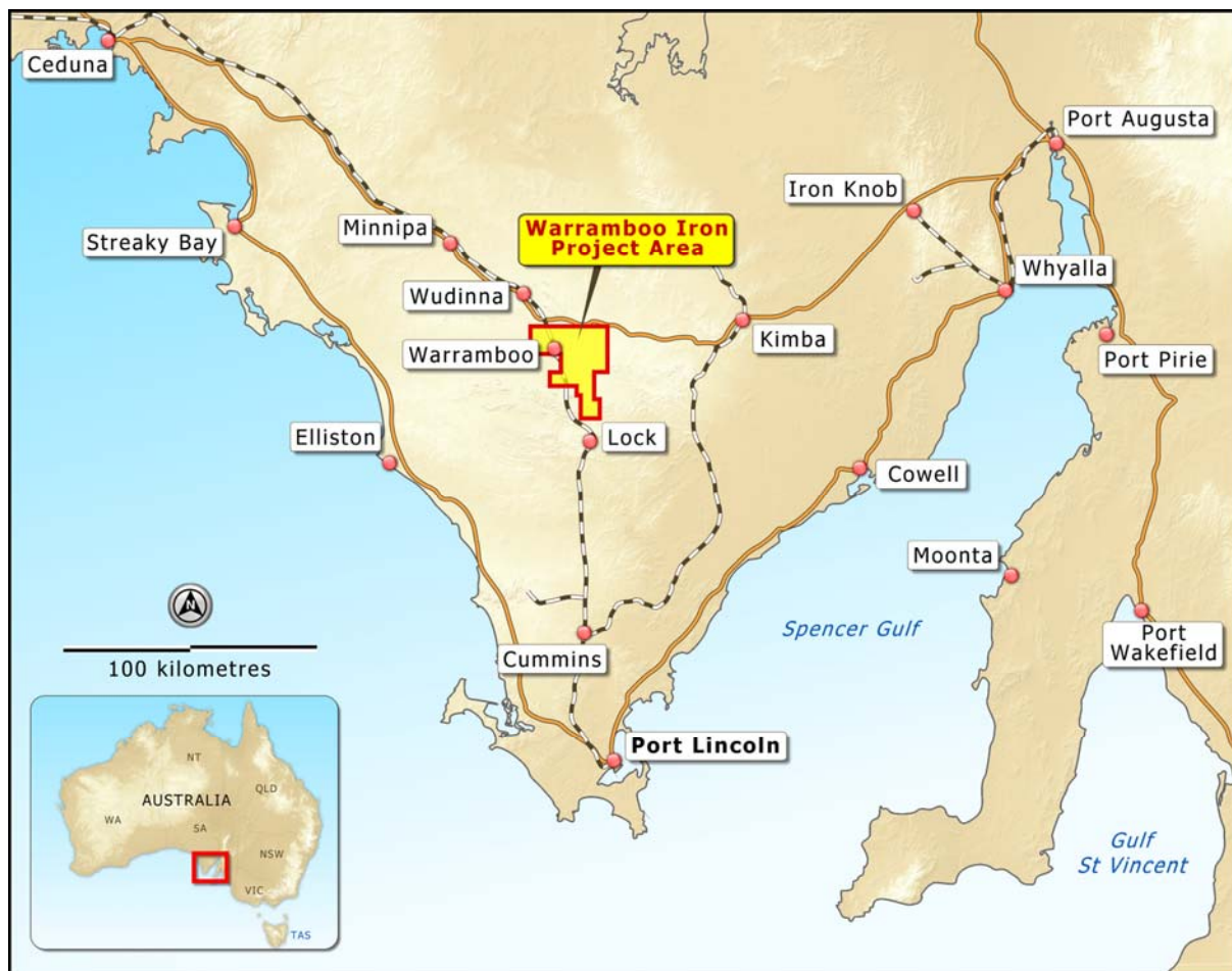
Figure 1 - Warramboo project location

The drilling will also provide material for an expanded metallurgical investigation, ore beneficiation test programme and an Order of Magnitude study. This initial programme is expected to continue for six to eight weeks.