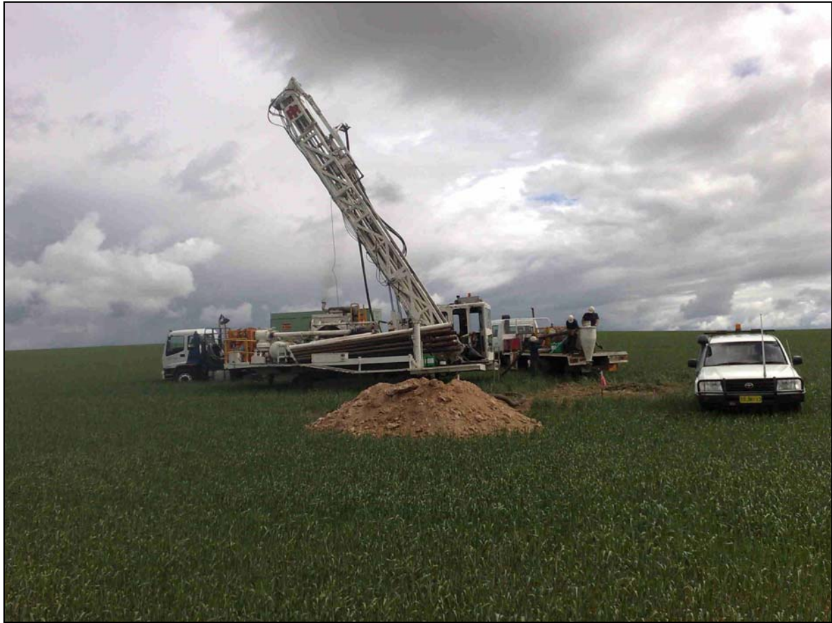
Figure 2 - Drilling commences at Warrambo