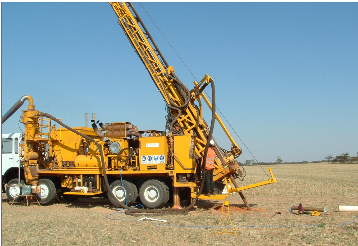
Figure 1 – Stage II drilling underway at Warramboe

"The success of the first Stage I program at Warramboe has led us to promptly initiate Stage II drilling at Warramboe. This is the next stage in progressing Warramboe from an advanced stage exploration project to potential development status. We are continuing to progress development options for the project, and look forward to the steadily strengthening market conditions for iron ore," said Mr Stocks.