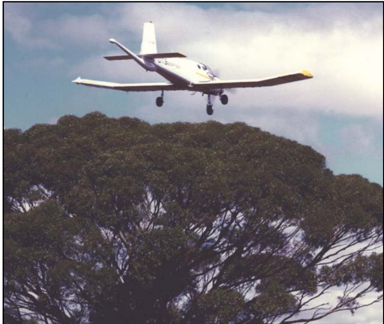
Figure 2 - A purpose built Fletcher aircraft will be used as the survey platform.

The survey line spacing is 50m, flown at a mean height of 20m for a total of 4,153 line kilometres (Figure 2). Hawke Geophysics will analyse and interpret the data and make recommendations to assist in the planning of exploratory and development drilling programmes.