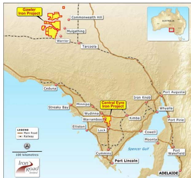
Figure 3 - South Australia project location map

Iron Road's principal project is the Central Eyre Iron Project, South Australia (Figure 3). This project is complemented by early stage projects prospective for iron ore mineralisation in Western Australia (Windarling, Murchison) and South Australia (West Gawler).