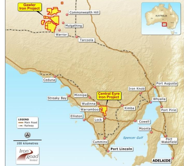
Figure 2 South Australia project location map

The information in this report that relates to Exploration Results and exploration targets at Murphy South is based on and accurately reflects information compiled by Mr Larry