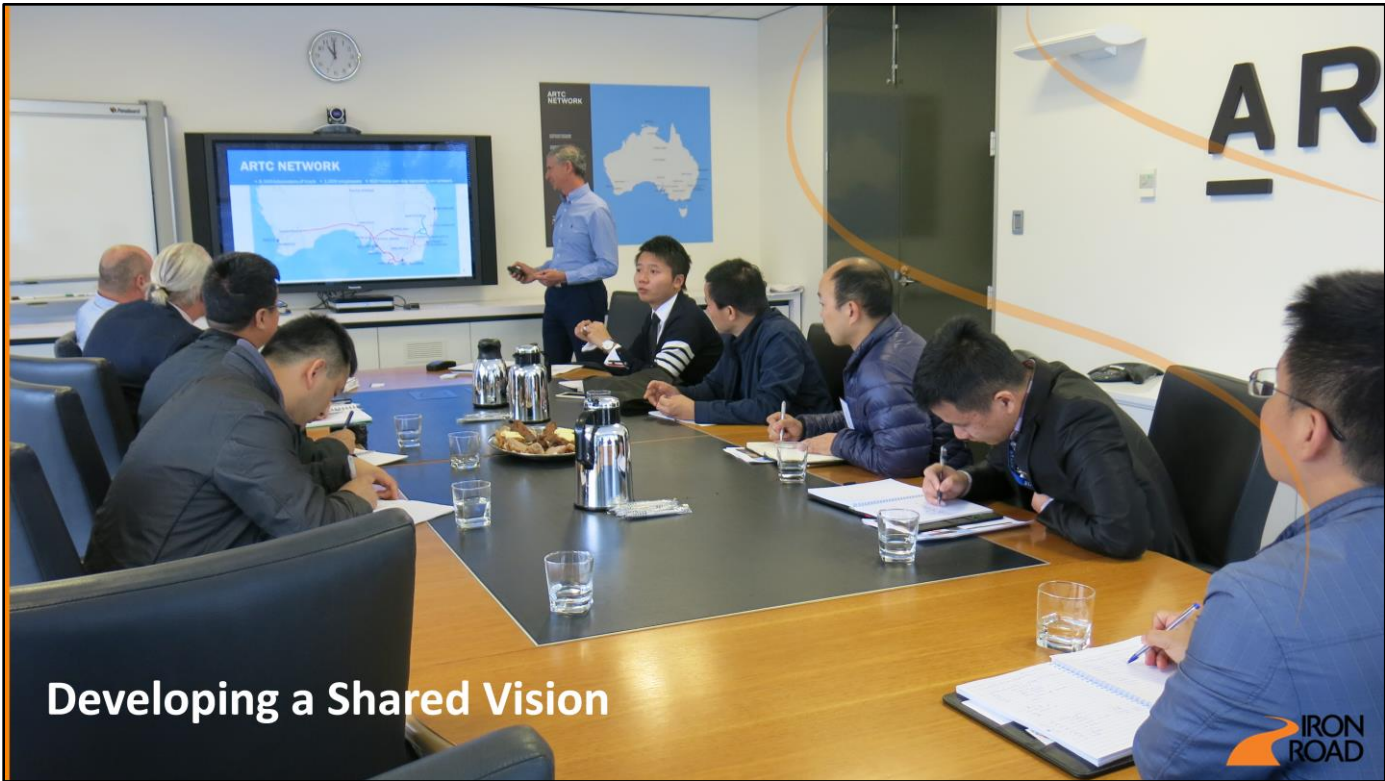
Image – Members of the Joint Development Team visit local stakeholders and businesses