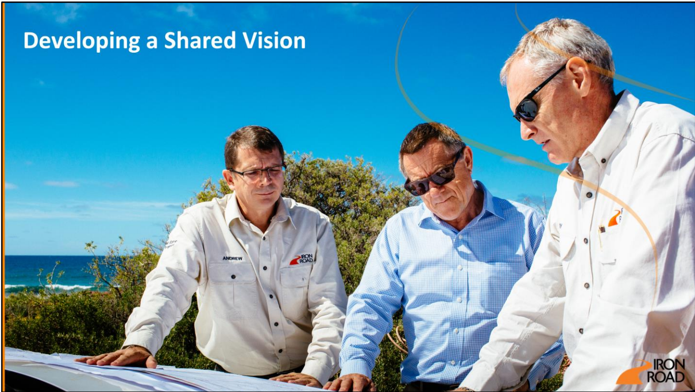
Image – Iron Road and Sumitomo subsidiary, Emerald Grain at the location of the proposed port location at Cape Hardy, South Australia.

Iron Road and Emerald Grain are jointly assessing opportunities to utilise the rail and port infrastructure – it introduces choice for local grain producers