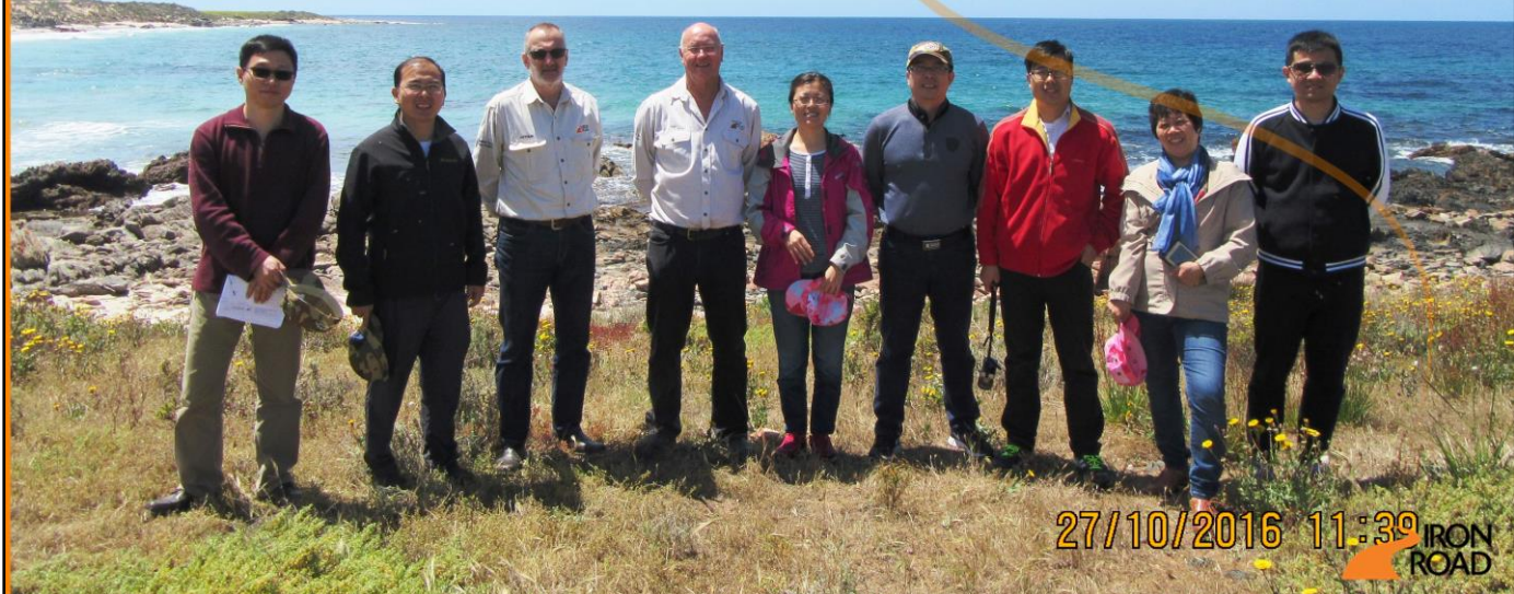
Image – Members of the Joint Development Team visiting proposed port site at Cape Hardy