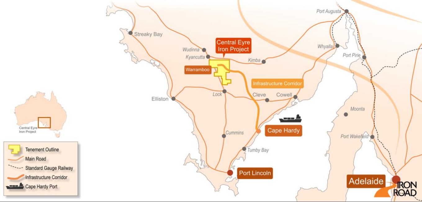
Location map of the Central Eyre Iron Project (CEIP) and its elements.

We have had a strong year developing a credible and bankable project