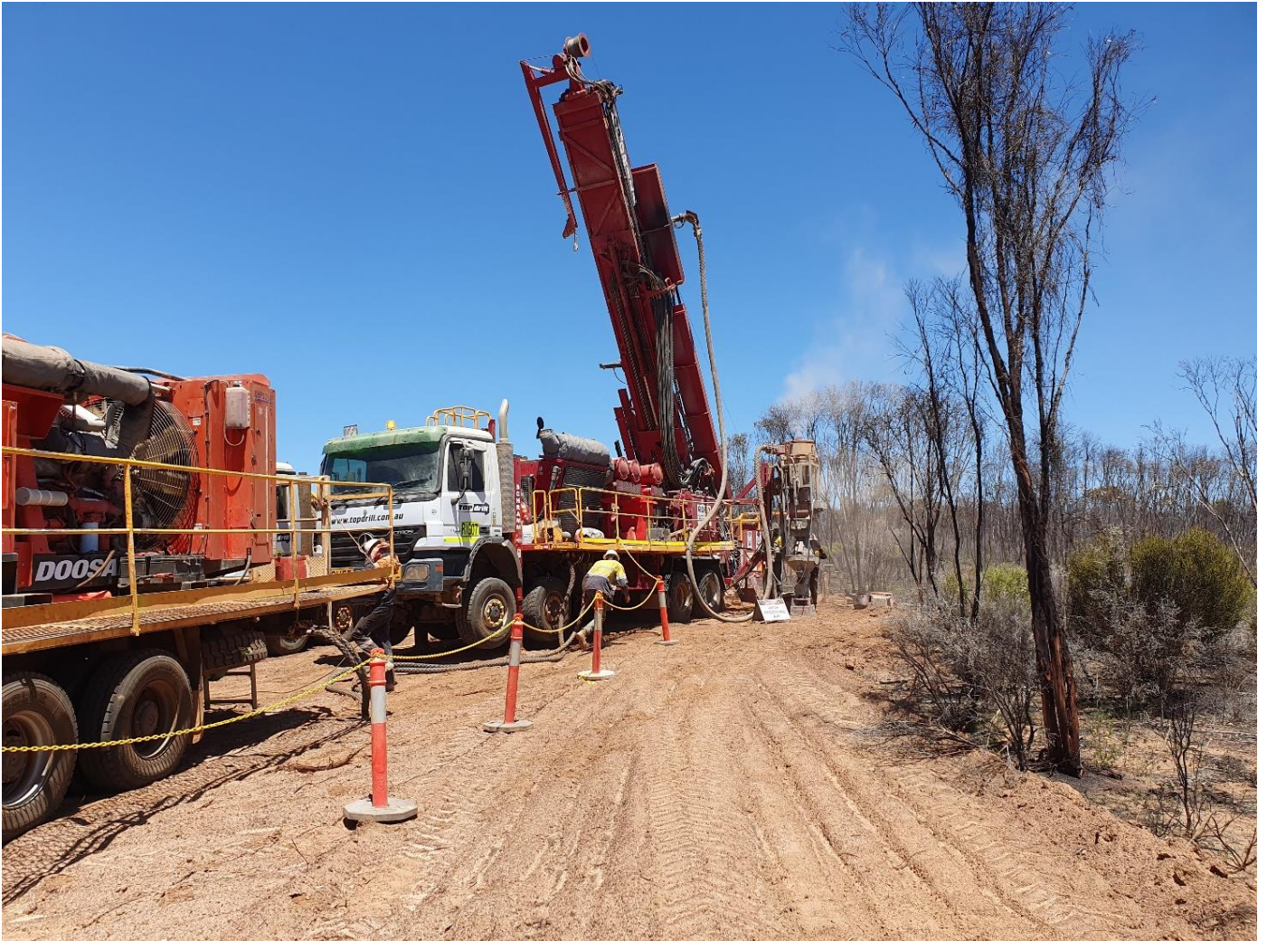
Figure 2 : Topdrill RC drilling rig on site at Lady Grey Project Mt Holland

The modelled conductor plate under MLEM Line #6 will be drilled from the existing historical access road which links the old Lady Ada mine and the Marvel Loch Forrestania Road. As the modelled conductor plate is 200m below surface and dips to the east the drill testing will consist of the three RC precollars with diamond tail drill holes as proposed in Figure 3.