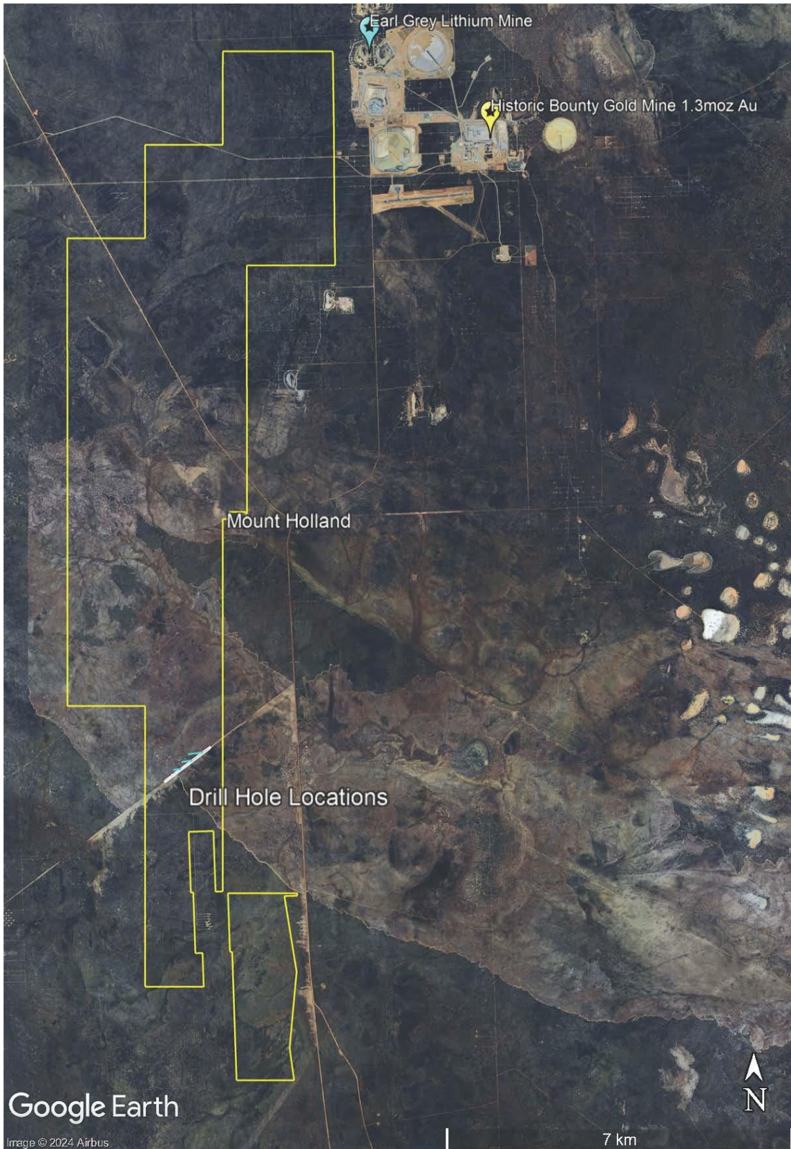
Figure 1: Lady Grey Project tenement E77/2143 outline (yellow), approved PoW Drill Line (white) and drill hole traces (blue), all overlain on a Google Earth satellite photo image.