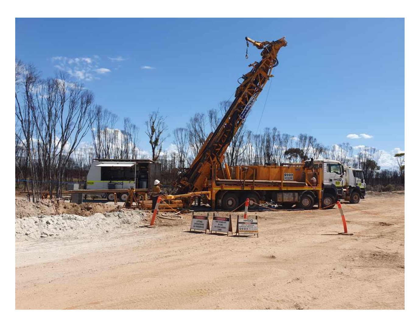
Figure 2: Topdrill diamond drilling rig on site at Lady Grey Project Mt Holland

The modelled conductor plate under MLEM Line #6 is being drilled from the existing historical access road which links the old Laday Ada mine and the Marvel Loch Forrestania Road. As the modelled conductor plate is 200m below surface and dips to the east the drill testing will consist of the three RC precollars with diamond tail drill holes as proposed in Figure 3.