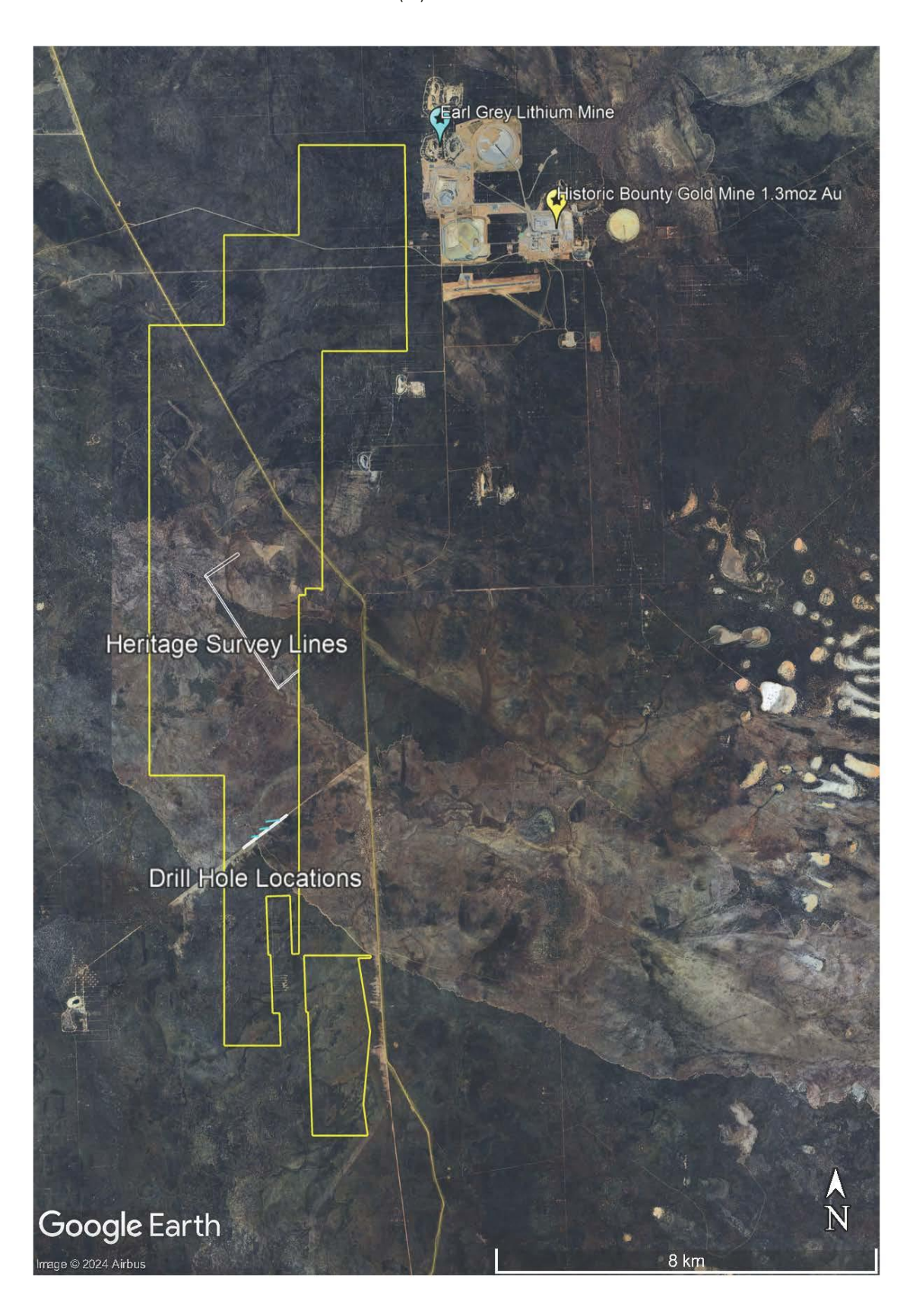
Figure 1: Lady Grey Project tenement E77/2143 outline (yellow), approved PoW Drill Line (white) and drill hole traces (blue), Heritage Survey Lines (white) a Google Earth satellite photo image.