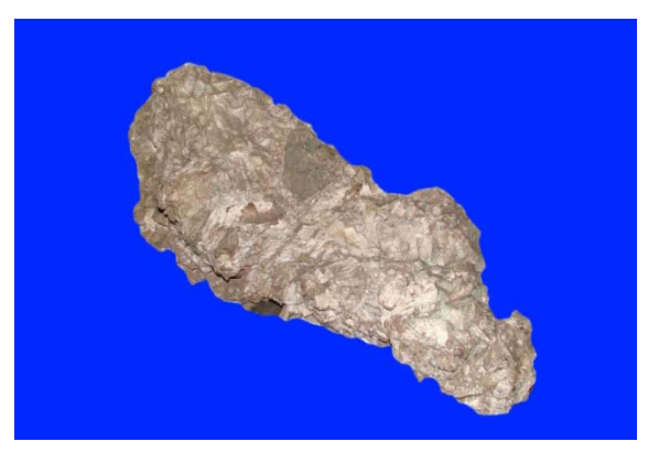
Figure 1: Giant silver nugget weighing 165kg discovered at Elizabeth Hill

Silver was mined from the Elizabeth Hill underground mine between 1998 and 2000, with 16,800 tonnes of ore mined producing 1,170,000 ounces of silver which at today's prices would have a gross value of AUD$21 million.