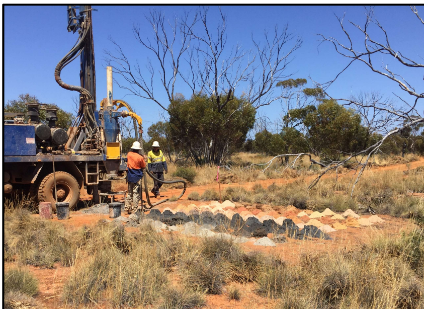
Aircore Drill Rig at Rockford Project, Fraser Range

The drilling will provide valuable information on the regolith depth/profile, basement lithologies and the lithogeochemical signature of the basement rocks. It will also provide data to enable selection and prioritisation of areas for the next phase of our innovative high power EM surveys. The programme is estimated to take 3-4 weeks to complete with assay results expected 4 weeks later.