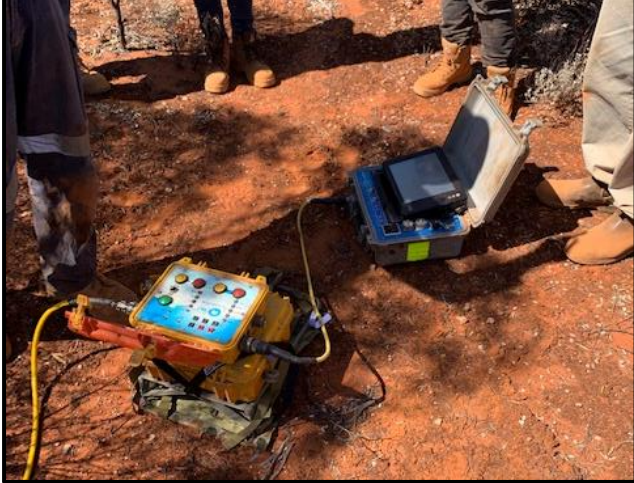
Area D: Low Frequency MLTEM Survey (Left) Generator/transmitter set up, (Right) Data Recording Instrumentation