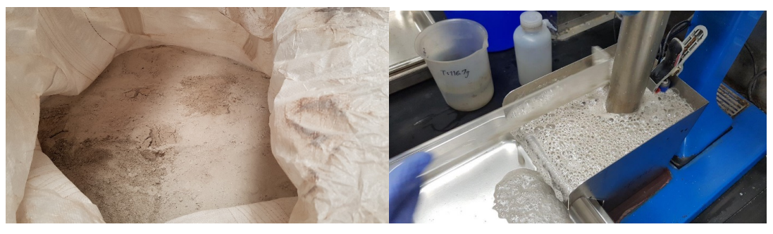
Figure 1. Initial sample of spodumene-bearing drill chips for testing.

The advent of COVID-19 in 2020 made operation of the pilot plant impractical, but with Australia's internal travel restrictions now lifted the programme has been reinvigorated. R&D testing of the first concentrates is scheduled to commence in September 2021.