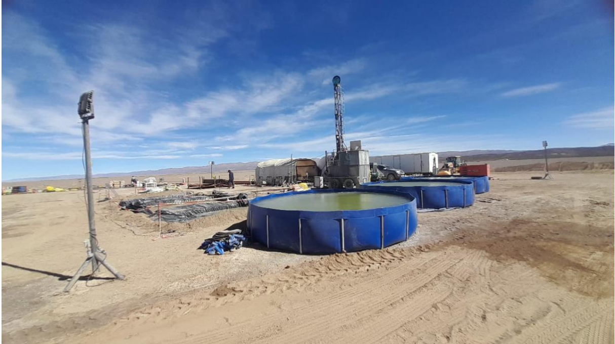
Figure 1: Diamond Drill Rig at SOZDD0007, Payo 1 Concession on Olaroz Salar