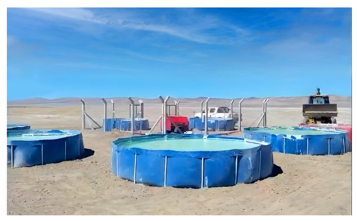
Figure 2: Solaroz Lithium Project Site Test Evaporation Ponds