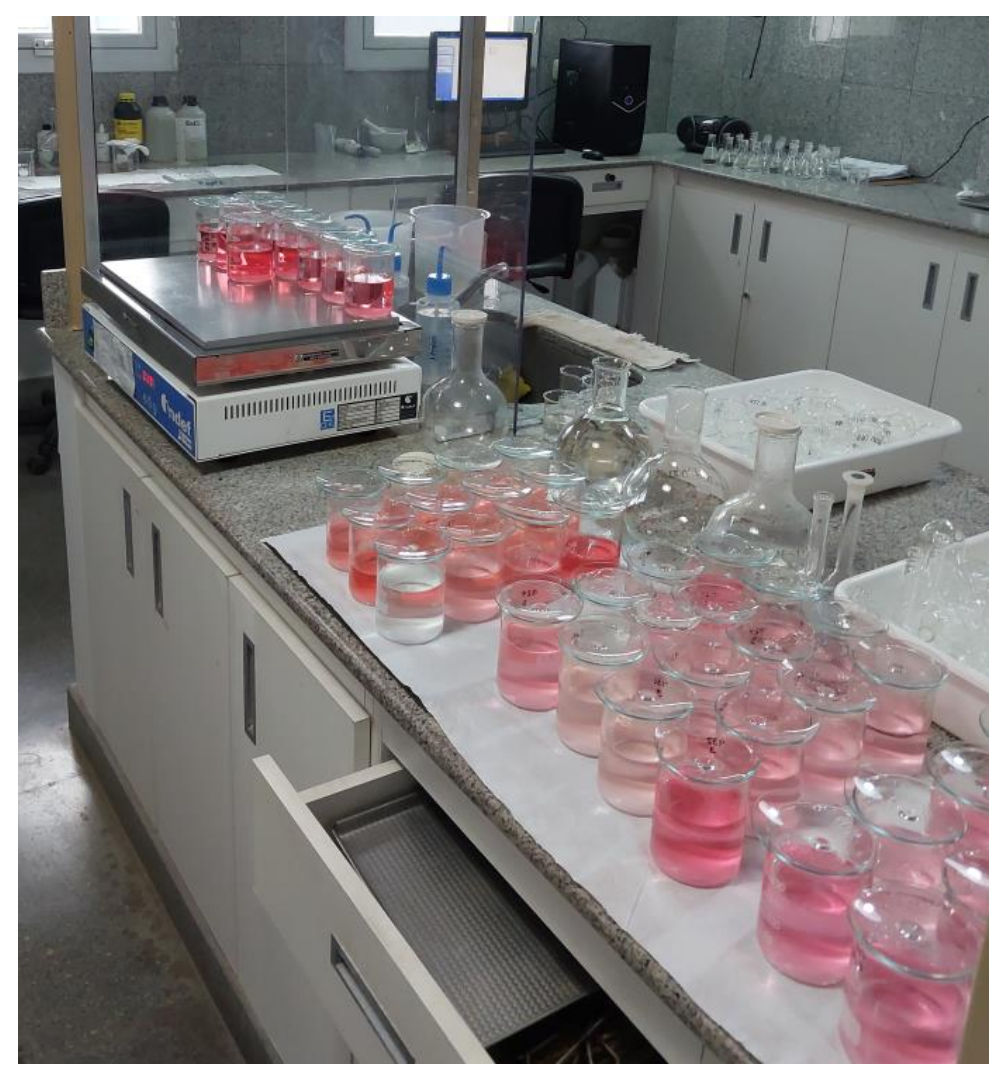
Figure 1: Norlab / Alex Stewart Laboratory

Norlab will be assisted with chemical assay and analysis by the highly respected Alex Stewart Laboratory, based in San Salvador Jujuy (refer Figure 1).