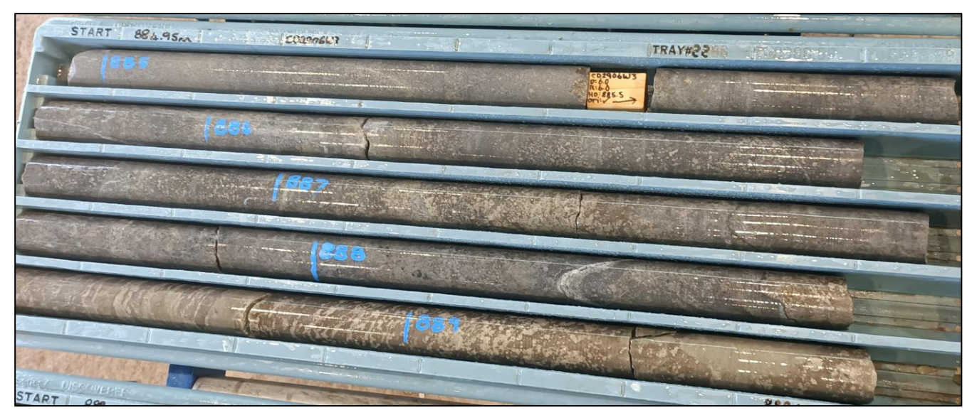
Figure 1: 884.95m to 889.40m in CD2906W3 – see Annexure 2 for full intercept details.

CD2906W3 is the final hole in a program designed to collect core for metallurgical test work at Foster South, a high-grade deposit at the Foster-Baker project ( FBA ), part of the Company's Kambalda Nickel Project ( KNP ).