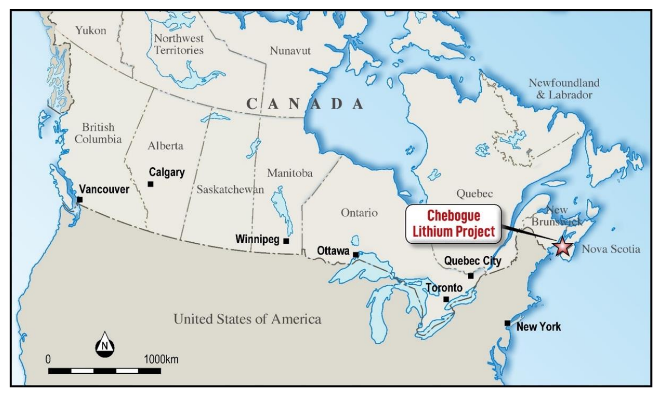
Figure 2: Location map of Chebogue Lithium Project

<u>The Company believes that similar, NE oriented (~050°), spodumene-bearing pegmatites may occur</u> further to the north and south of Brazil Lake along a northeast trending (~020°) stratigraphic sequence of metavolcanics and metasediments. This sequence of up to ~4 kilometres wide, runs parallel to, and to the west of the Chebogue Point Shear Zone.